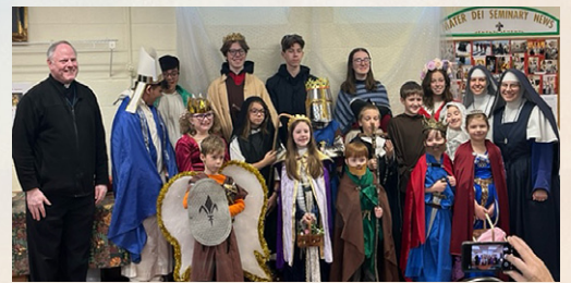
Top: Students and staff of St. Joseph's Academy, Wayne, Michigan, enjoy a day at the pumpkin patch. Bottom: Students celebrate All Saints' Day by dressing as saints.