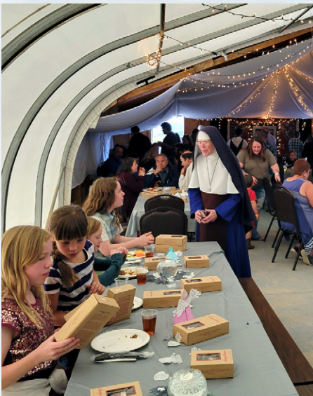
As one of the founding Sisters of Holy Guardian Angels Academy in Olathe, Rev. Mother was invited to join in their Silver Jubilee celebration.