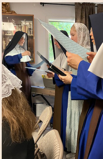
On the feast of the Holy Name of Mary, several Sisters and the sodality from Mount St. Michael traveled a few hours south to Lewiston, Idaho, to sing a high Mass for the parish's patronal feast.