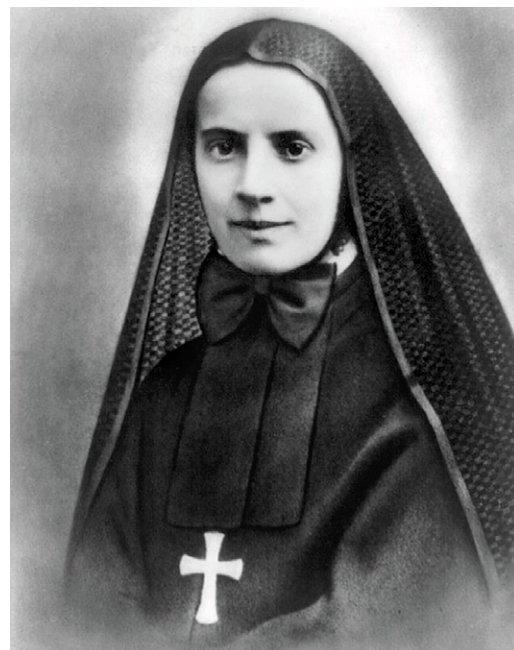
Setting aside her own weakness and fears, Mother St. Frances Xavier Cabrini is a model of what it means to be a soldier of Christ.

enthusiastically recite sections from Thomas a Kempis's chapter on the Royal Road of the Holy Cross, and even more enthusiastically sing and march to the tune of "An Army of Youth." What a positive outlook on life can be fostered if we teach children that instead of seeking self and pleasure, real fulfillment