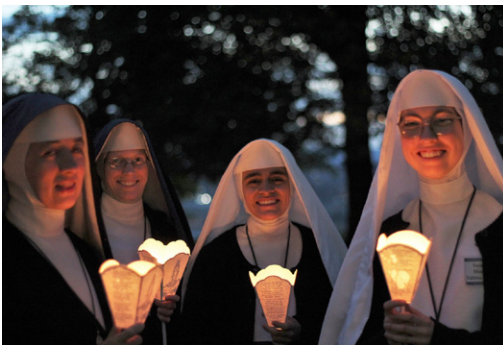
One of the highlights of the Fatima Conference is the Candlelight procession.

Our Lady of Prompt Succor (January 15) Our Lady of Lourdes (February 11)