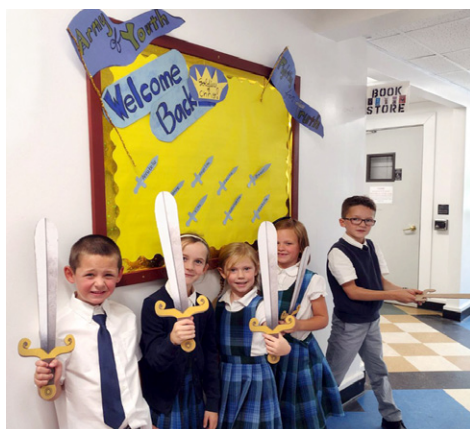
Students of St. Theresa's School (Maine) learn more about the school theme and being "An Army of Youth" by getting to hold paper swords.

Autumn has come and gone. A season of rich fullness and of dying. Warm colors against grey skies. Bountiful harvest amid the beautiful frost. As the leaves turn vivid colors they are the focus for many an art project, or just for marveling in appreciation of God's handwork. In consonance with the themes of harvest and gratitude that distinguish this season on the natural level come the harvest feasts of the