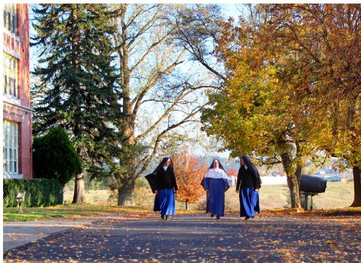
On a recreational walk, three Sisters enjoy the beautiful fall colors during Spokane's Indian summer.

Church: Mary's Assumption, Christ the King, All Saints and All Souls: "From all the saints in warfare, for all the saints at rest: to Thee, O Blessed Jesus, all praises be addressed!" All Saints' day celebrations are followed by the visits for the souls in Purgatory and the month-long devotions that bring the Holy Souls so much relief. And Thanksgiving can never be totally secularized, no matter how the world may try. Thanks as Chesterton holds, is the highest form of thought. Prayers of gratitude to Our Heavenly Father must fly the most swiftly to His throne.