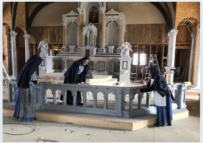
Little by little, work on the church at St. Joseph's Parish in Olathe, Colorado, progresses. The Sisters stationed there take time to work on communion rail.