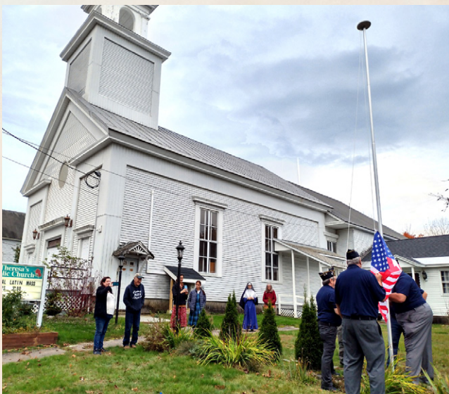
Proud to be an American! The local American Legion erects a flagpole for St. Theresa's Church, performing a military ceremony as they hang the flag for the first time.