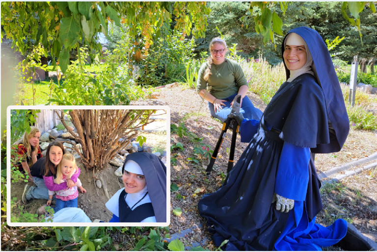
The Sisters at Holy Guardian Angels Academy in Olathe, Colorado, work with parishioners to beautify the grounds for their school's 25th anniversary celebration.