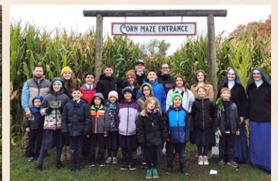
The first quarter was a busy one for St. Philomena's Academy in Middleville, Michigan. Activities included the All Saints' Day celebration (top), and a visit to an apple orchard and a corn maze.