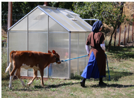
Halter training Dawn the calf is one of the duties of the Sisters at the novitiate.