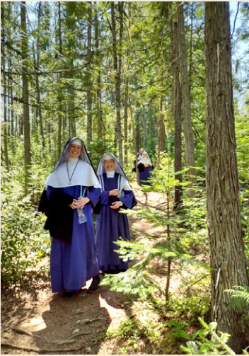
Hiking back from Canada (about 1/4 mile) to where the van was parked at Gardiner Caves.