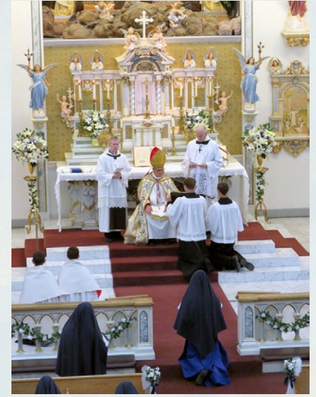
"I, an unworthy sinner, ask to renew my vows as an oblate Sister of the Religious Congregation of Mary Immaculate Queen."