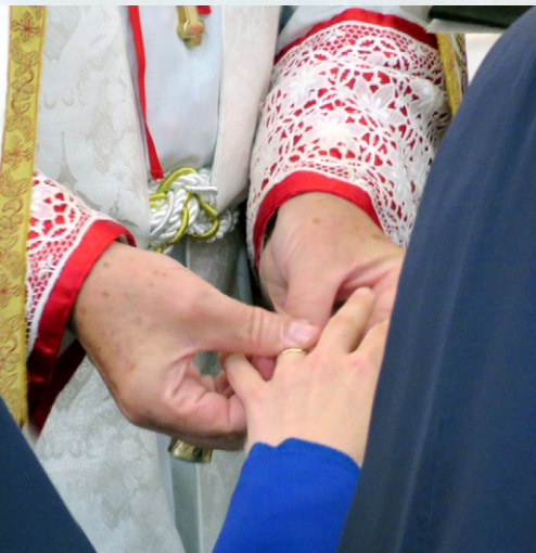
"Receive the ring of fidelity, the seal of the Holy Ghost, so that henceforward thou mayest rightly be called the spouse of God."