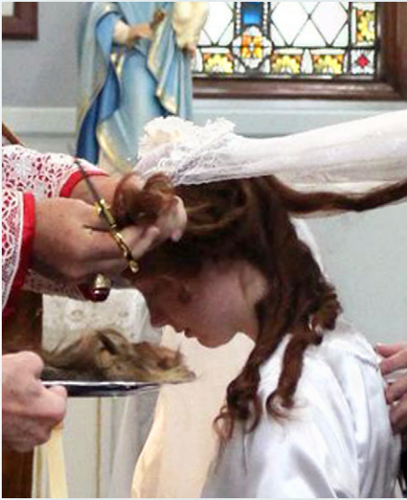
Before receiving the white novice veil, the postulant, in a simple white dress and veil, has her beautiful tresses cut off by the Bishop.