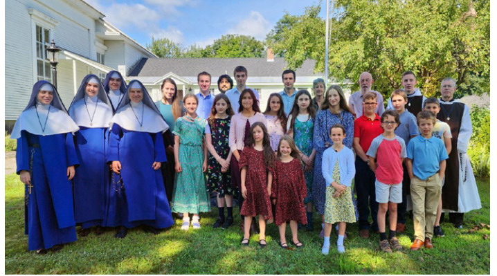
Sisters coming and going! Two Sisters newly assigned to our New England missions joined the veterans in organizing the camp in Maine.