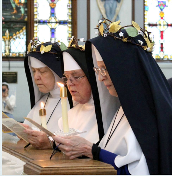
Three Sisters celebrating their golden jubilee renew their vows and consecration to Our Lady.