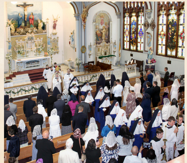
"Hail Holy Queen enthroned above!" The congregation joined in singing the triumphant hymn as the Sisters processed out of church following the vows ceremony.