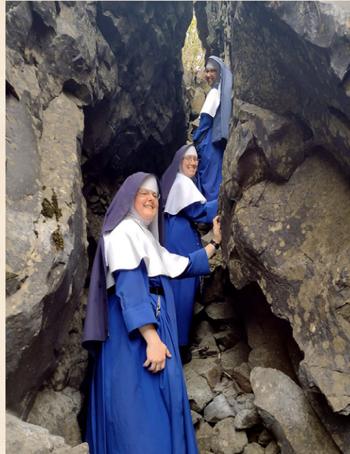
Just as in the spiritual life, we sometimes ascend by more adventurous and difficult paths...