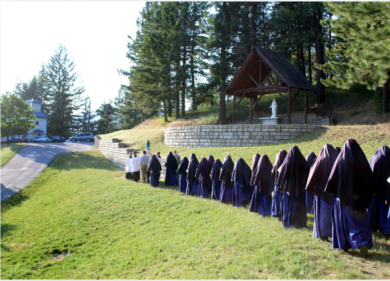
The Sisters joined the July 13th rosary procession in honor of Our Lady of Fatima at the "City of Mary" in Rathdrum, Idaho.