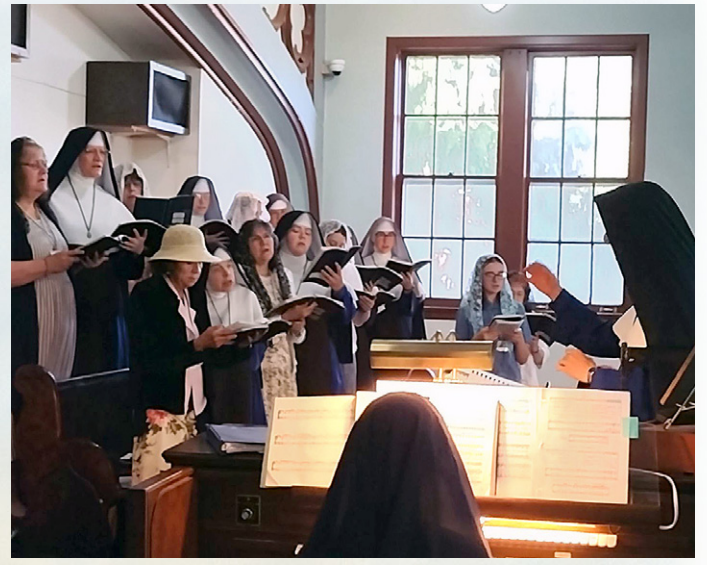
Retreatants and Sisters sing the Sunday High Mass together during the Ladies' Retreat at Mount St. Michael.