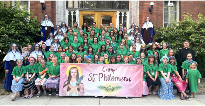
We had a larger than usual percentage of younger campers at the Mount this year, and many new campers as well as those from past years — and counselors who enjoy camp as much as the campers!