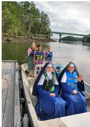
Sisters enjoy a boat ride while visiting a family en route to meeting the other Sisters.