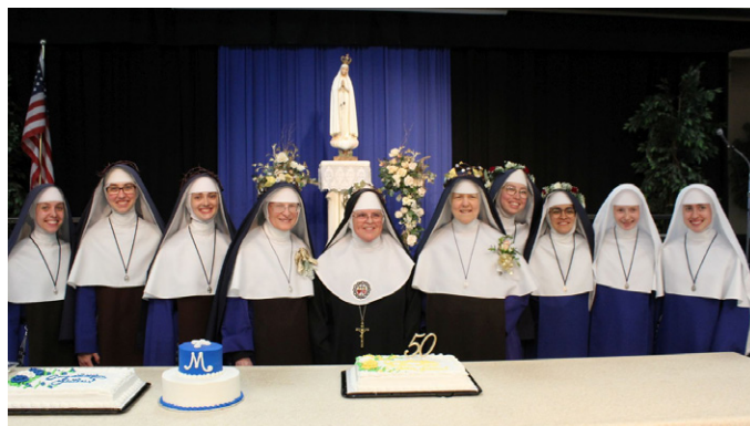
The group photo after the vows ceremonies included three Golden Jubilarians, two Sisters who made their perpetual profession of vows, three Sisters who renewed their vows, and two new novices.

It is hard to believe that with this issue we