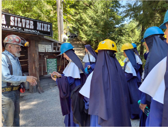
No, it is not a career change, just a tour of the very interesting history and process of silver mining in the Northwest.