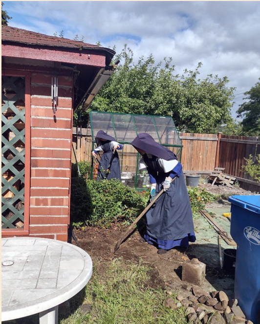
The close of the school year brought time to catch up on gardening at St. Mary's Convent in Tacoma, Washington.