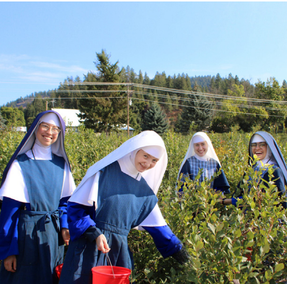
Beaming blue nuns pick big beautiful blueberries under a bright blue sky.