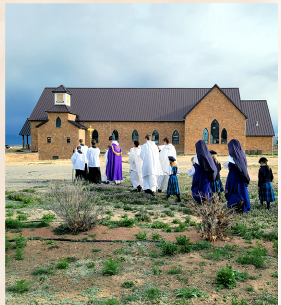
The Sisters stationed in Olathe, Colorado, join with the clergy and students in the Rogation Day procession.