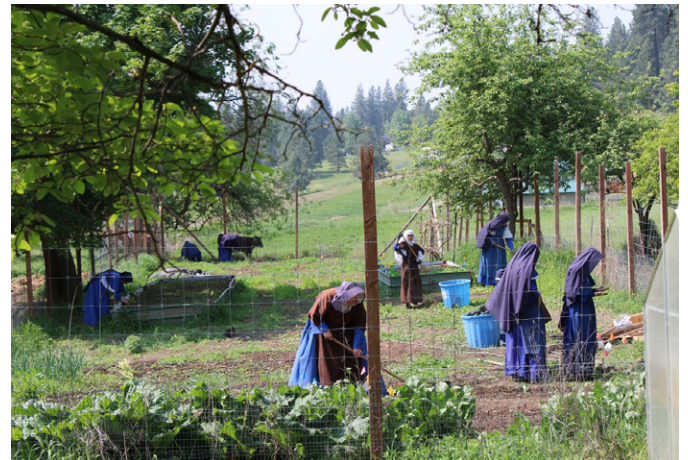
Several Sisters from the Motherhouse take part in a garden work party at the Novitiate to help with the weeding and planting.

born in 1474, and had the great advantage of growing up in a pious home in which her parents instilled in their children a great love for their faith and taught them the lives of the saints. A story which made a particular impression on young Angela was that of St. Ursula and the virgins who were martyred with her. Angela resolved to dedicate her life to God; this determination stayed with