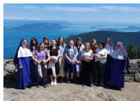
Sisters and Villa girls on their end-of-the-school-year outing.

So isn't it time to put first things first?