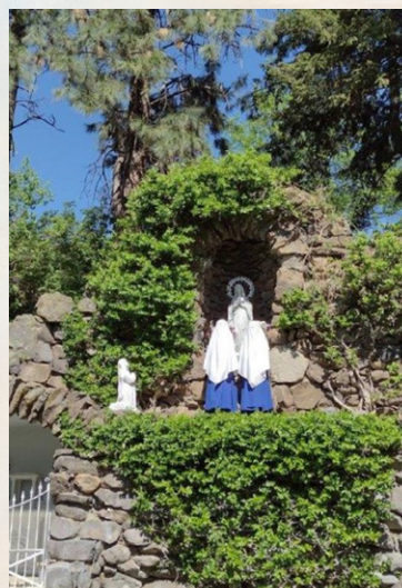
Novices present the bouquets from the living Rosary to Our Lady of Lourdes on Mother's Day.