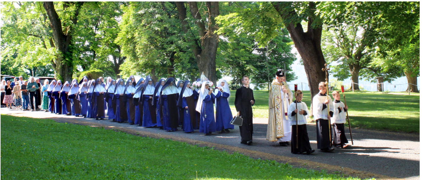
In fulfillment of a promise made to Our Lady, the Sisters carry the statue of Mary Immaculate Queen in a procession every year on her feastday. This year the parish joined in praying a Rosary in her honor.

her even when, after the death of her parents, her uncle tried to arrange a good marriage for her. Angela, even as a young woman, had gathered other women around her to help educate girls in their faith and in other needful areas. The founding of a religious order for this purpose — named in honor of her childhood heroine, St. Ursula — would come about only in the last years her life.