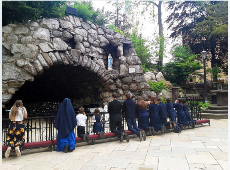
St. Philomena's Academy took a school trip to visit Sacred Heart Basilica at Notre Dame, Indiana, stopping to pray at the Lourdes grotto there