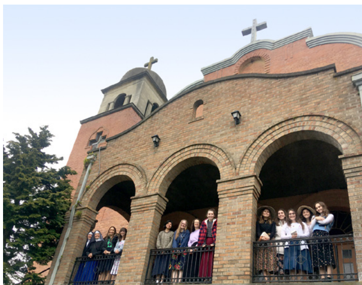
On the senior trip to western Washington, the Sisters and young ladies attended Mass on Ascension Thursday at St. Joseph’s in Mount Vernon.

O Heart aflame with heavenly fire, To learn this love to thee I turn! Light in my heart this conflagration! Sweet Heart of Mary, be my salvation!