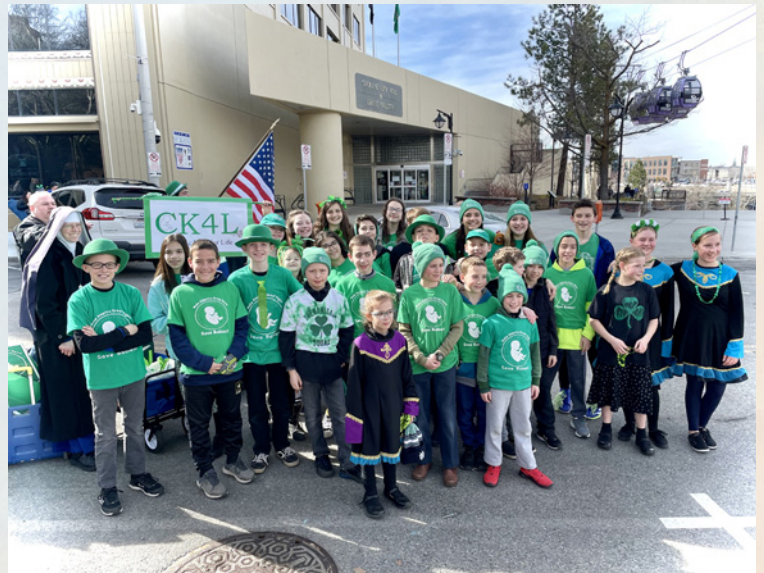
Mount St. Michael's Catholic Kids for Life participated in Spokane's St. Patrick's Day parade. Providentially their club color is green.