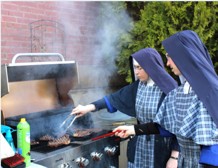
The first time we used the outdoor grill was Easter Sunday, despite the fact that this spring was so cool and wet that it snowed on Good Friday! (We ate inside.)