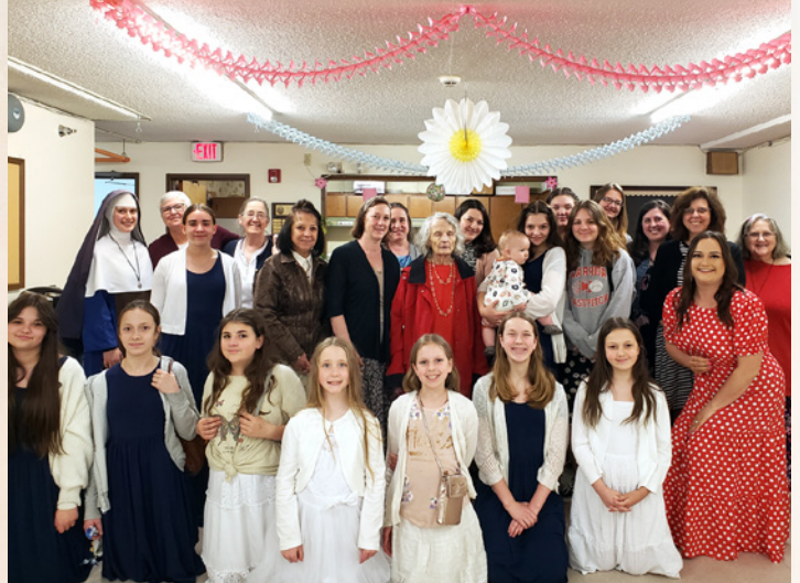
The Sisters in Tacoma, Washington, joined their parish's festivities as they celebrated Ladies' Day.