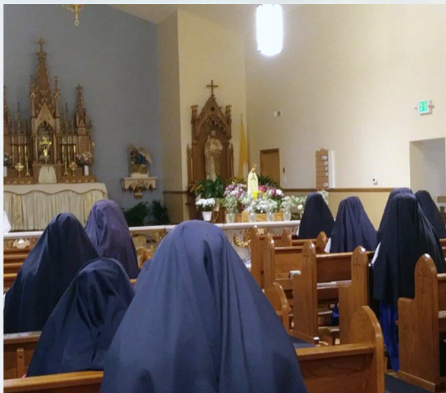
Honoring our heavenly Mother on Mother's Day, the Sisters prayed a living Rosary at Mary Immaculate Queen Church, Rathdrum, Idaho.