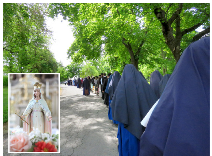
When the pandemic first began, the Sisters promised Mary Immaculate Queen to have her statue carried in a Rosary procession each year on her feastday in thanksgiving for her maternal protection.