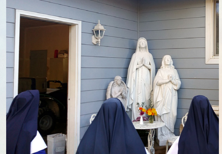
On the 100th anniversary of the blessing of Lourdes Grotto at Mount St. Michael, the Sisters at MIQ Parish made a "pilgrimage" to the original statue to pray the Rosary. After the statue was vandalized in 2009, and the missing pieces found, a parishioner at MIQ Parish restored it, and now lovingly keeps it to await a new grotto of its own.