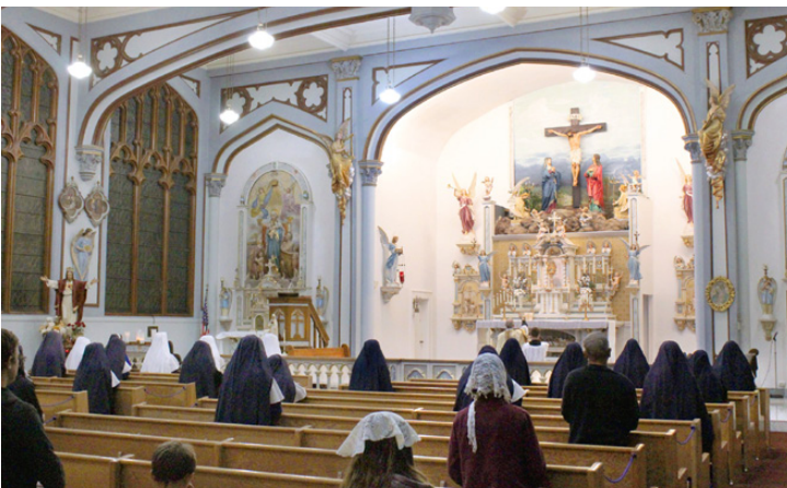
In accordance with a decree of Pope Leo XIII, the Sisters and parishioners recited the Rosary in the presence of the Blessed Sacrament exposed daily throughout the month of October.

“Night shall be thrice night over you, And heaven an iron cope. Do you have joy without a cause, Yea, faith without a hope?”