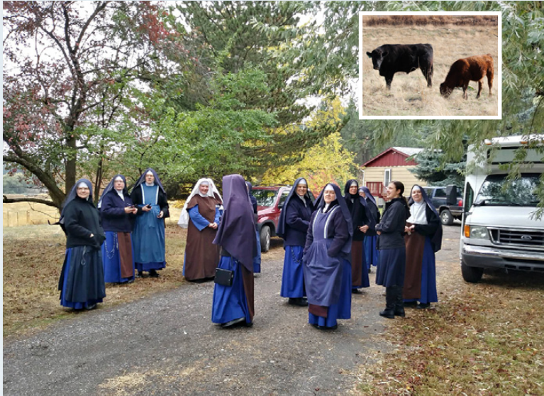
Sisters and volunteers gather at the novitiate for instructions before searching the area for our two steers that went missing. The hunt was unsuccessful, but the fugitives (Buddy and Clyde — see inset) were finally located a week later several miles away.