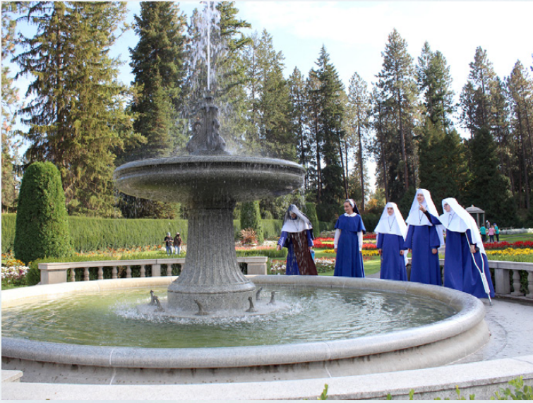
The novitiate Sisters admire the fountain in Duncan Garden during an afternoon outing to Manito Park in early October.