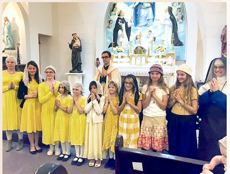
Girls of Most Holy Rosary Church (Middleville, Michigan) were excited to take part in the first Children of Mary Sodality advancement ceremony in their parish.