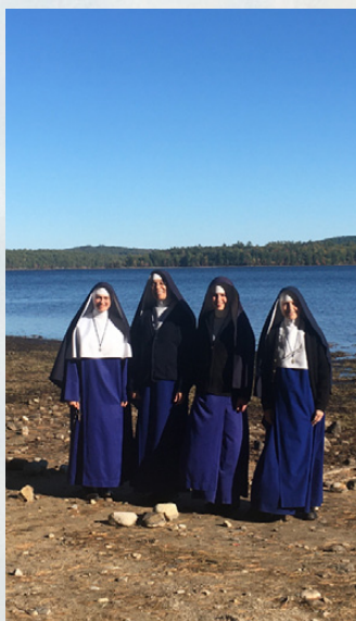
Our four New England Sisters got together for an autumn walk at a nearby lake.