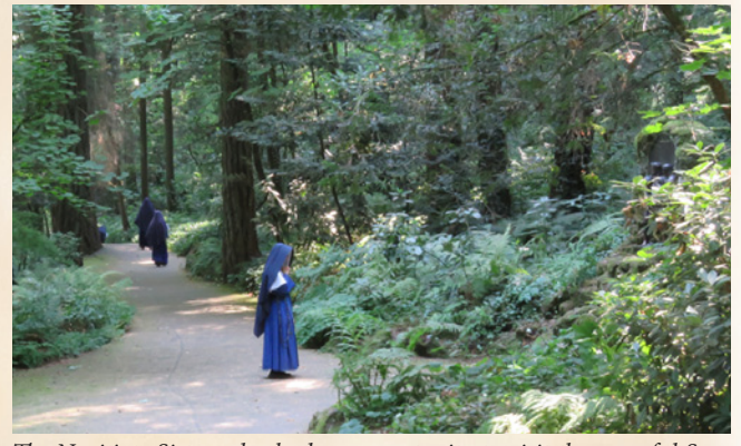
The Novitiate Sisters also had an opportunity to visit the peaceful Sorrowful Mother Shrine in Portland, Oregon. After exploring the beautiful grounds, they made the Stations along the outdoor Way of the Cross.