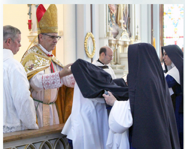
After making their first profession of simple vows, the four white-veiled novices receive the blue veils of the professed.