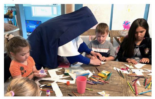
In addition to instruction and stories, catechism camps, such as the one in Lewiston, Idaho, also involve some hands on learning through arts and crafts.