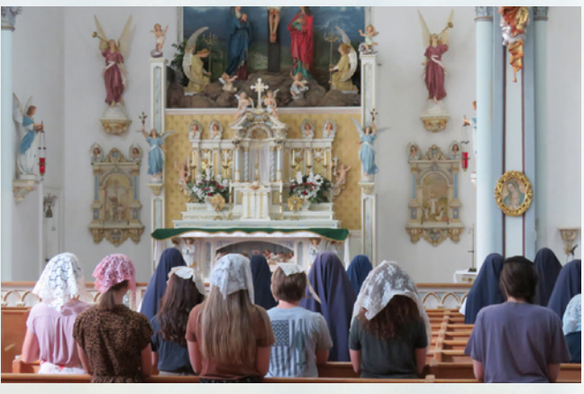
Every quarter, young ladies in the Inland Northwest are invited to spend an afternoon or evening with the Sisters.