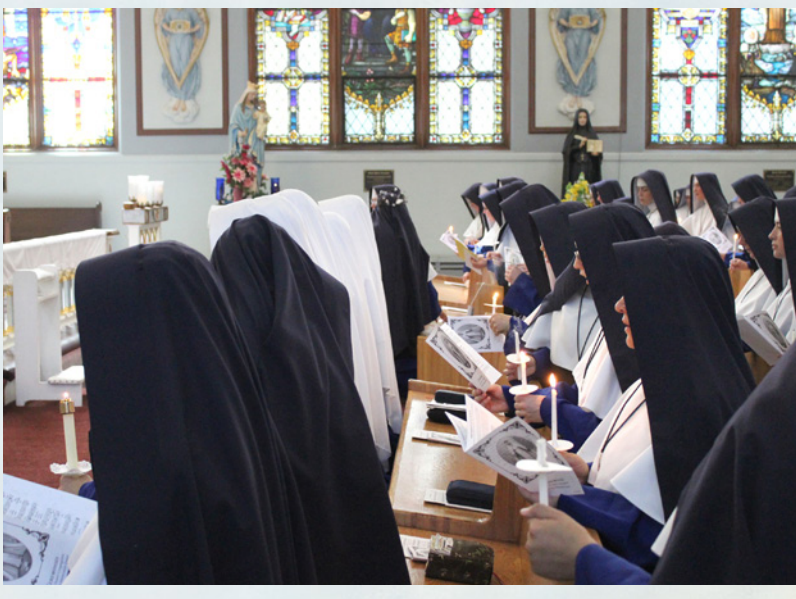
After formally processing into the church with lighted candles, the Sisters conclude the chanting of the solemn Salve Regina from their places.