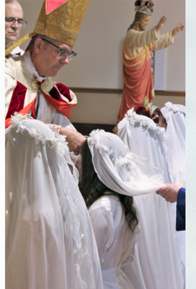
The postulants, arrayed in white dresses, have their hair cut to signify that they are giving themselves wholly to God.

Vows Ceremonies on June 27, feast of Our Mother of Perpetual Help, at Mary Immaculate Queen Church in Rathdrum, Idaho