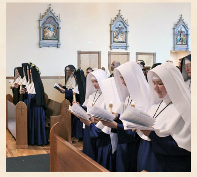
With hearts overflowing with joy, the Sisters chant the Te Deum at the close of the vows ceremonies.