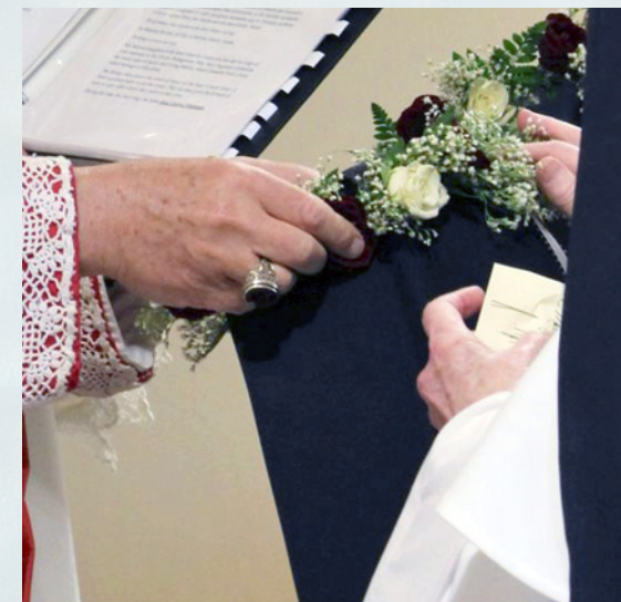
having made their first profession of vows, Sisters who take their first vows also receive a crown of red and white roses, symbolizing a life of virginity and martyrdom.