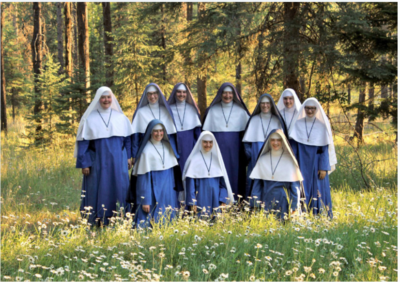
This beautiful meadow full of daisies in the mountains on Montana was a perfect setting for a group photo of the junior and novitiate Sisters during their summer outing.