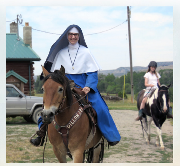
While visiting a traditional Catholic family in Montana, the novitiate Sisters had an opportunity to go horseback riding.