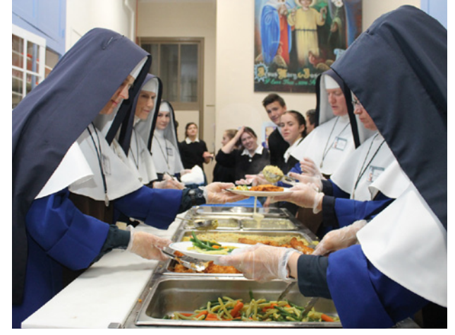
Sisters plate the Fatima Conference banquet while servers wait to carry the plates out to our 230+ guests.

The Mount chapel saw a steady stream of Sisters,