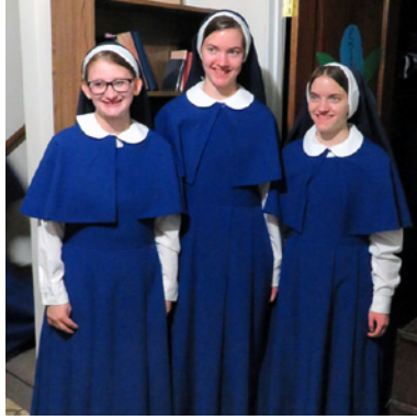
A triple blessing on Our Lady's birthday! Our community continues to grow with the arrival of three new candidates.

In the second week of school now, we are still getting settled in the new kitchen, but with the biggest part of this project behind us, we can focus on the new school year, dedicated to being Warriors of the Queen, our Life, our Sweetness and our Hope.