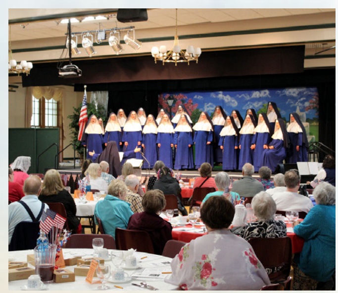
What's on the menu? Every July, the Sisters host a luncheon concert at which they cater the meal and then sing.