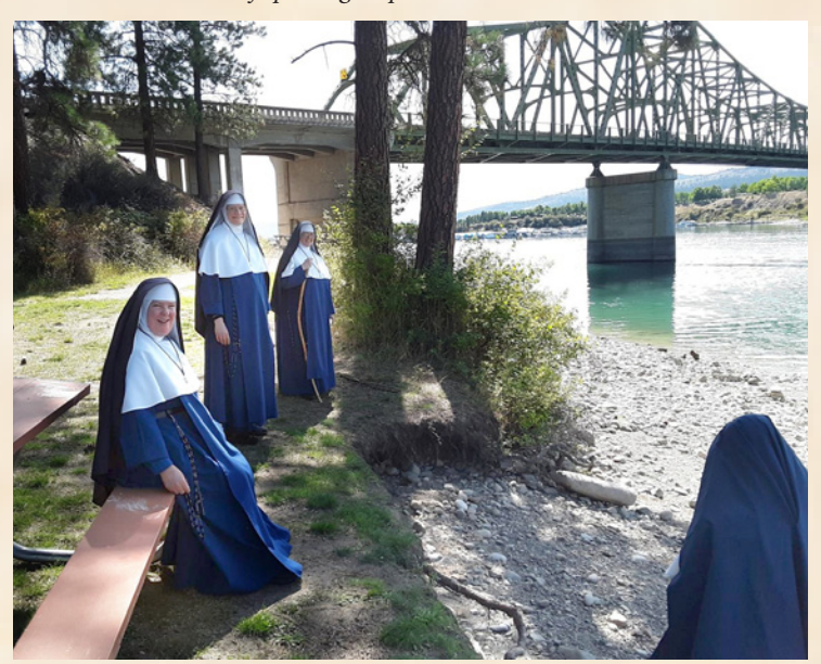
A short day trip up to Fort Spokane provided the Sisters with a change of scenery, and several lessons in local history at the interpretive center.