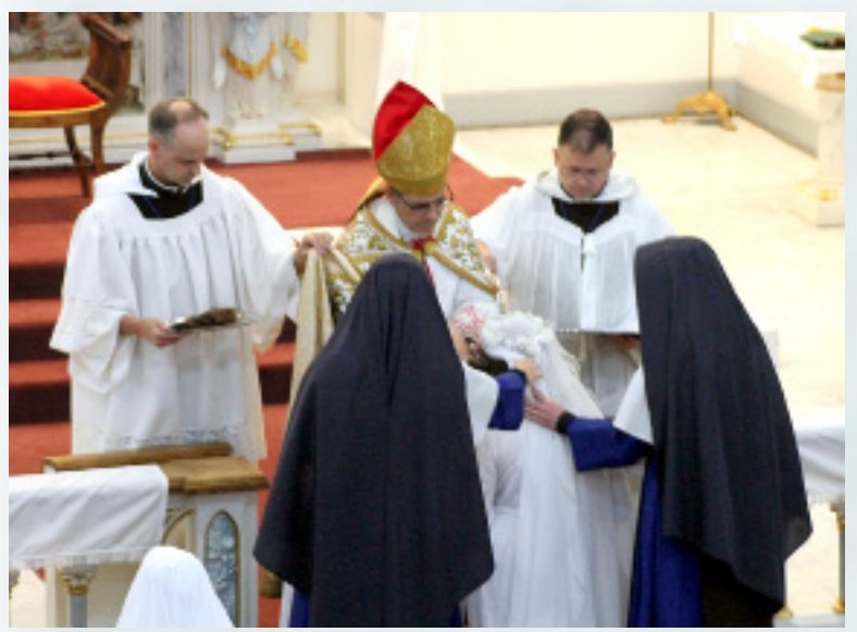
As a symbol of complete donation of oneself to Christ, the young lady entering the Novitiate has her hair cut at the altar.