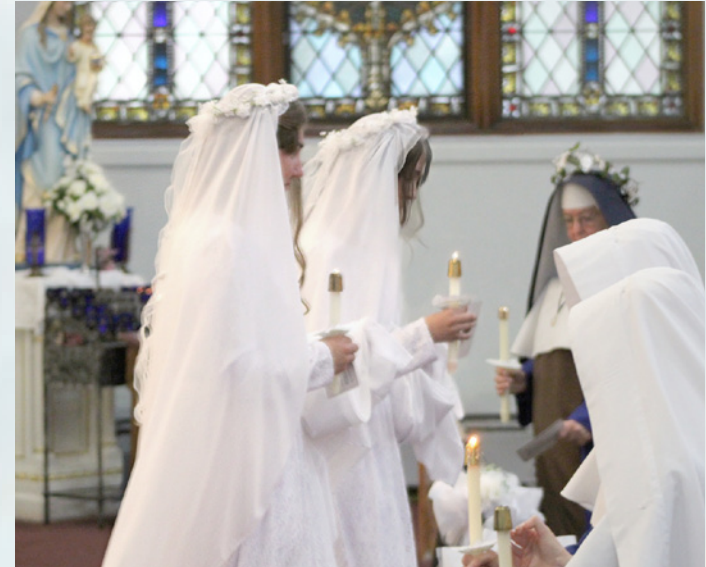
Having been accepted into the novitiate, the Sisters leave the church to change into the full habit for the first time.