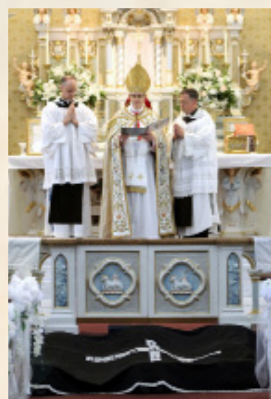
The pall covers the perpetually professed, symbolic of their life hidden in Christ.