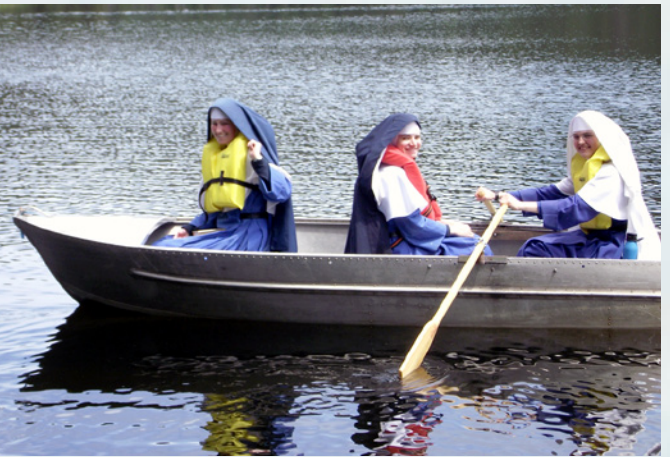
Though nearby, the Junior Sisters had their outing elsewhere in Montana, and had water adventures of their own.