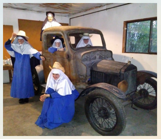
Without the hats, the novices could have passed as Sisters from days gone by.