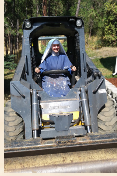
New projects at the Novitiate mean new adventures for the novices!