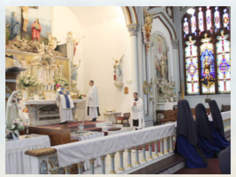
With lighted candles in their hands, the three Sisters taking perpetual profession present themselves before the altar during Mass.