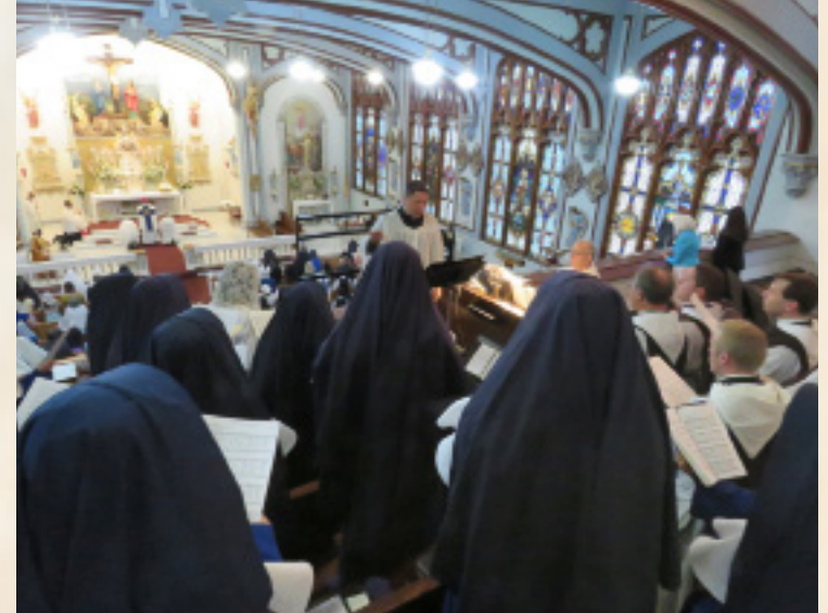
Up in the choir loft, the Sisters join the priests, clerics and Brothers in singing a high Mass on vow day, the feast of Our Mother of Perpetual Help.