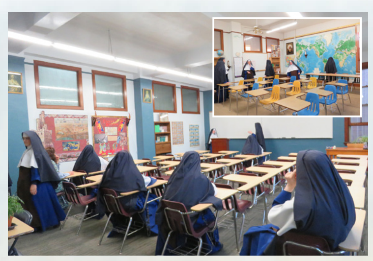
During Labor Day weekend, the Sisters at Mount St. Michael visited the various classrooms, including the newly renovated "Room 226." Inset: The Sisters look around the fourth floor literature/history classroom.