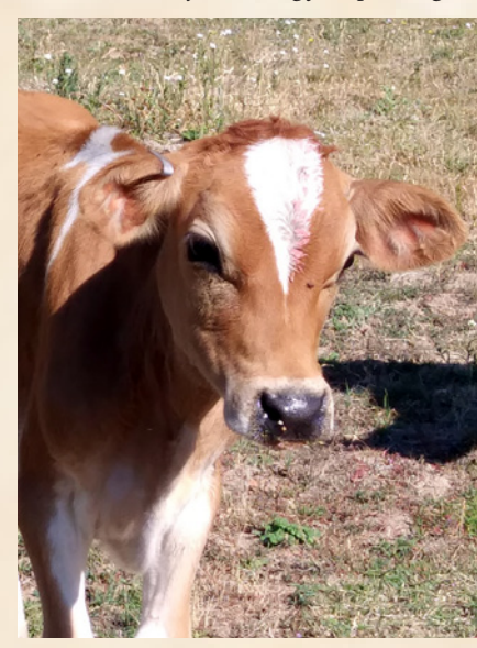
Thessalonica (Thessie), a young Jersey cross, is the newest addition to the novitiate farm!