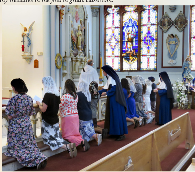
During the annual Ladies' Retreat, on the feast of the Assumption, eleven women consecrated themselves entirely to Jesus through Mary.