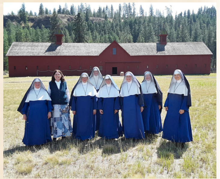
The Sisters stand infront of the Fort Spokane Quartermaster stable, one of only four buildings remaining since its closure in 1898.