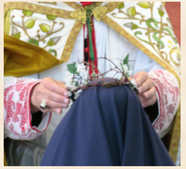
The final professed receives a crown of thorns, a reminder of the life of penance in union with her thorn-crowned Spouse.

Receiving the ring, the Sisters says, "I am the bride of Him Whom the angels serve . . . He has sealed me with the character of His spouse."