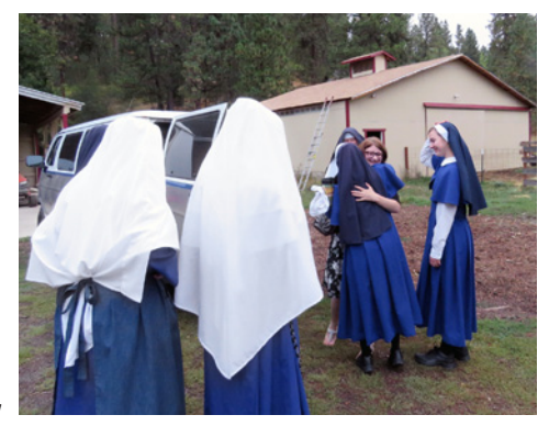
Welcome! The novices look on as the twin candidates greet the third member of their group.