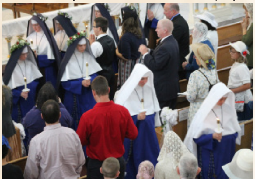
A vocation is reason to celebrate! With their hearts filled with joy and gratitude, the Sisters process out of the church to enjoy a reception prepared by their families and friends.