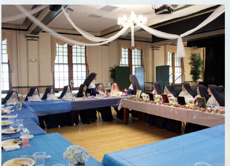
When celebrating the feast days of the five Sisters with June patrons, the Sisters also tagged on the added festivities of this year's three septagenarian birthdays.