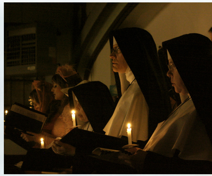
The Sisters participate in the beautiful ceremonies of the Easter Vigil, joining the Church in celebrating the triumph of Christ the Light of the World.