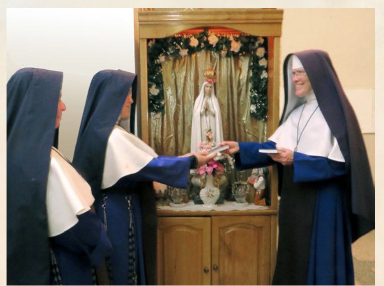
On our patronal feast, Mary Immaculate Queen, the Sisters were presented with a newly bound copy of their Holy Rule.