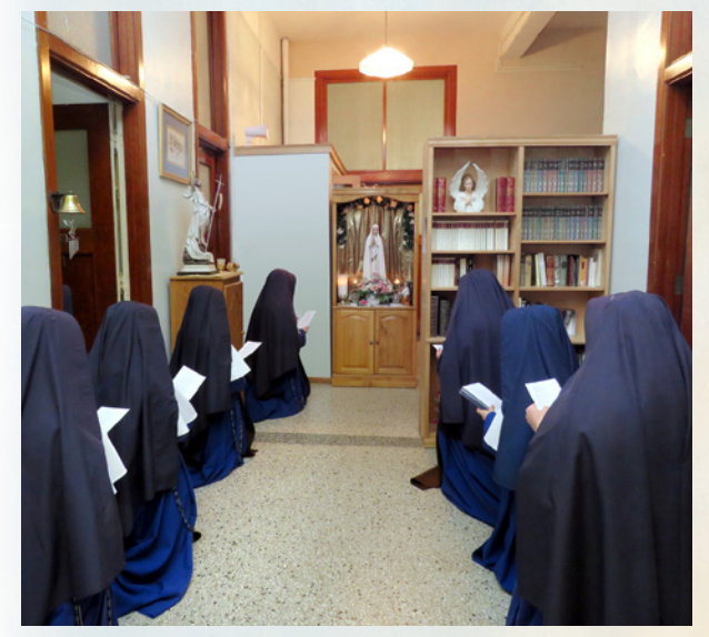
The Sisters' May devotions include the crowning of Our Lady every evening before dinner. The ceremony wouldn't be complete without a Marian hymn.