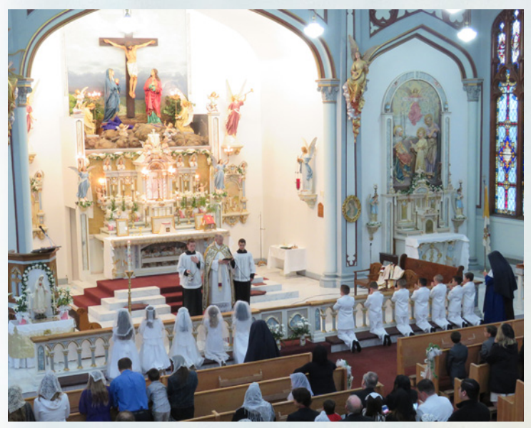
It is such a joy and privilege for Sisters to prepare the children for the coming of Jesus into their hearts for the first time in Holy Communion.