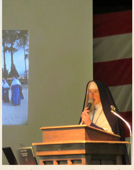
To honor the Fatima Centenary the Sisters hosted a breakfast for St. Michael's parish along with a slideshow of their Fatima Pilgrimage.