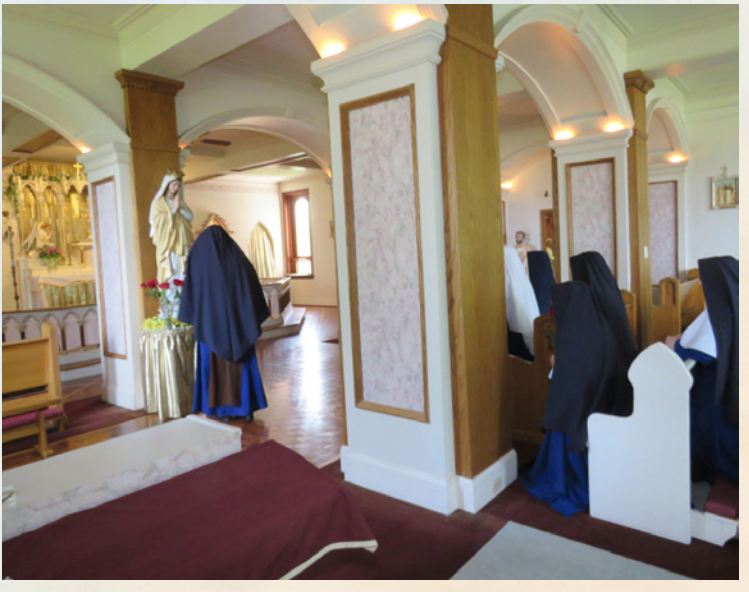
On Mother's Day, the Sisters pay special homage to our Heavenly Mother. This year, we had a living Rosary, with a presentation of roses to Our Lady.