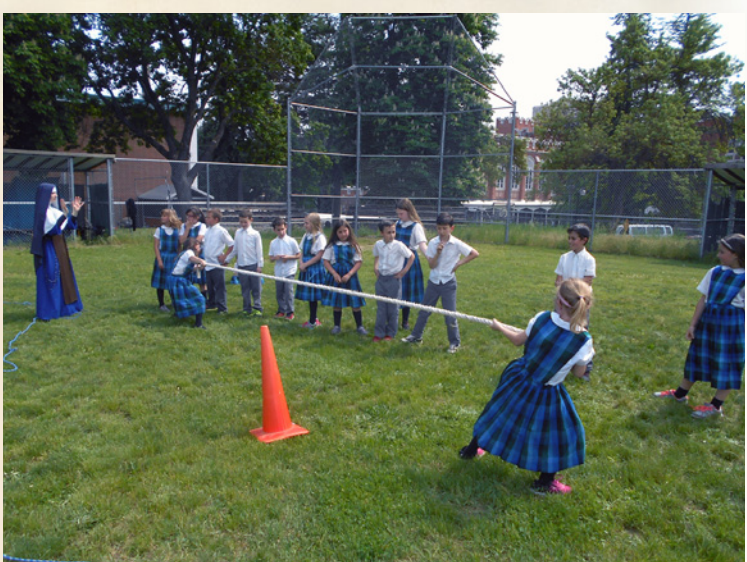
"Heave ho!" Students at St. Michael's Academy participate in a field day on May 8. Athletic skills, coordination and muscle were all put to the test.