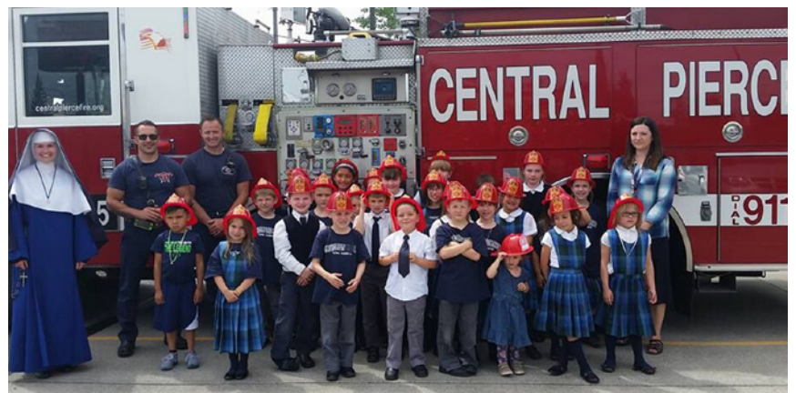
The primary grades of St. Mary’s Academy in Tacoma took a trip to the local fire station. One can never be too young to learn about fire safety.