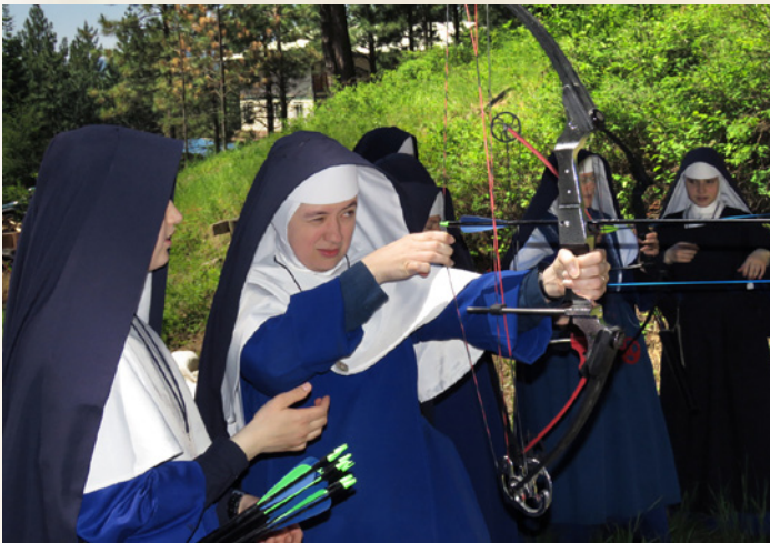
Ready, aim, fire! Memorial Day provided the Sisters with a little holiday at the City of Mary, Rathdrum, ID. While some Sisters enjoyed a round of frisbee golf or played volleyball, others took some lessons in archery.