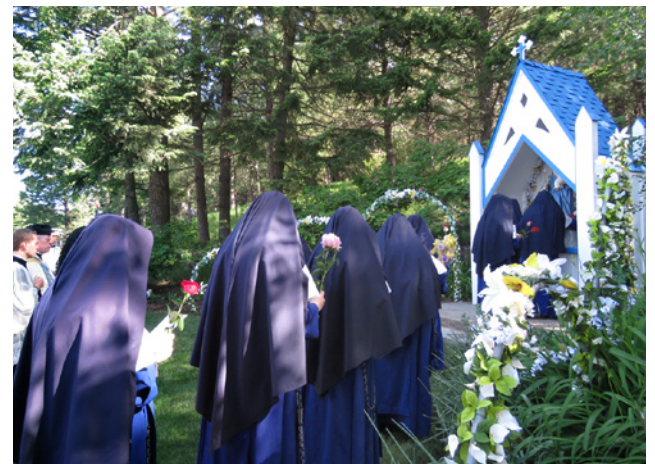
“Bring flowers of the rarest...” The Sisters join City of Mary parishioners presenting flowers at Our Lady’s outdoor shrine.