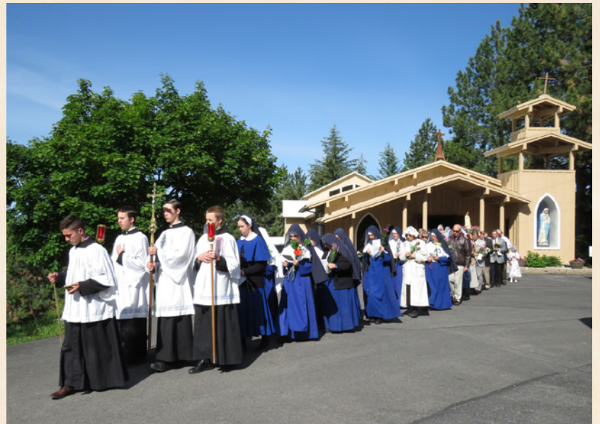
The Sisters were invited to join the Rosary procession at Mary Immaculate Queen Parish to celebrate their titular feast.