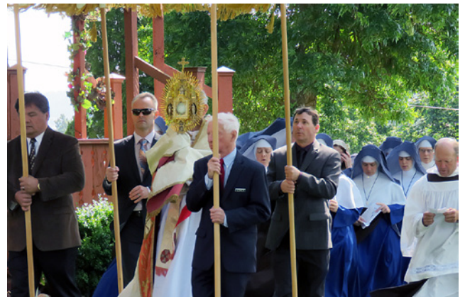
Jesus — the highlight of our lives! The Sisters follow behind the Blessed Sacrament, singing hymns of praise on Corpus Christi.

P.S. “Follow” us on our pilgrimage at our blog: wecomeonbendedknee.blogspot.com