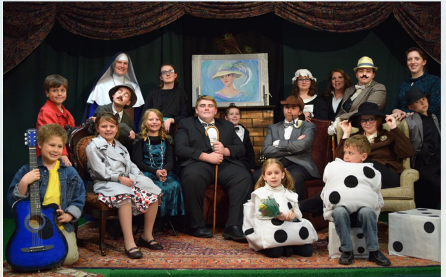
The students of St. Joseph's School in Wayne, MI, put on a mystery dinner theater to raise funds to attend the ordinations in Omaha, NE.