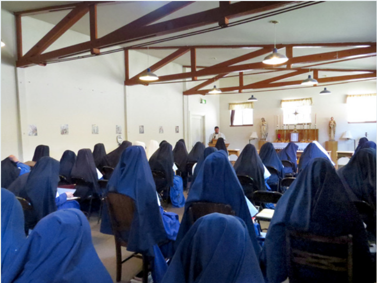
Retreat this year was both a change of scenery and a change of pace. Here, the Sisters listen attentively to the retreat master's conference.