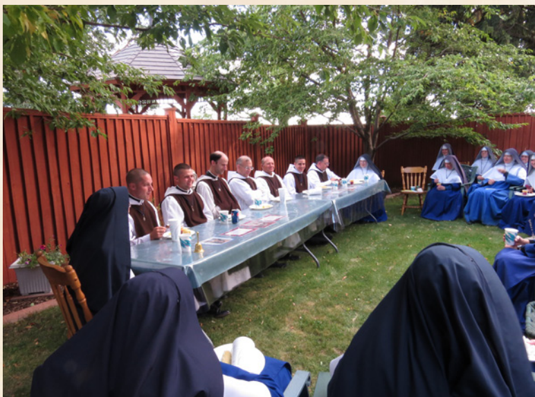
Three seminarians from Omaha visited Mt. St. Michael this summer to help with the windows project. A feastday provided an opportunity to join the Sisters for dinner.