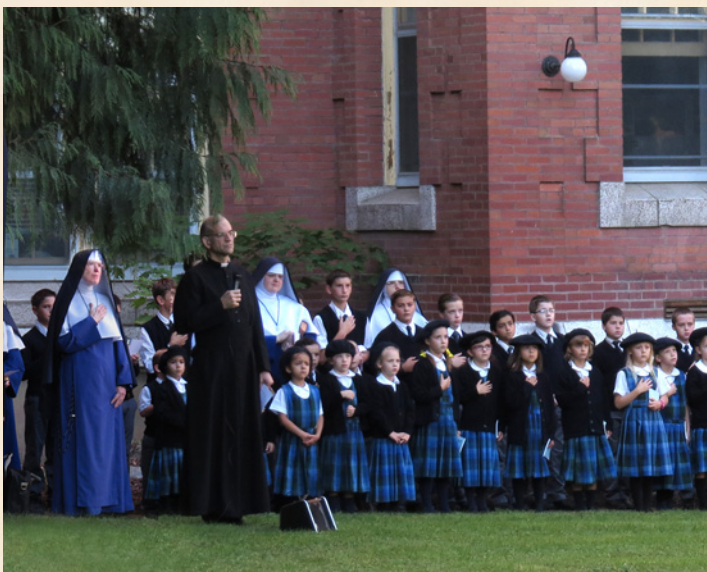
Faculty and students of St. Michael's Academy held a special memorial on September 11, praying for all who lost their lives at the tragedies of 9/11.