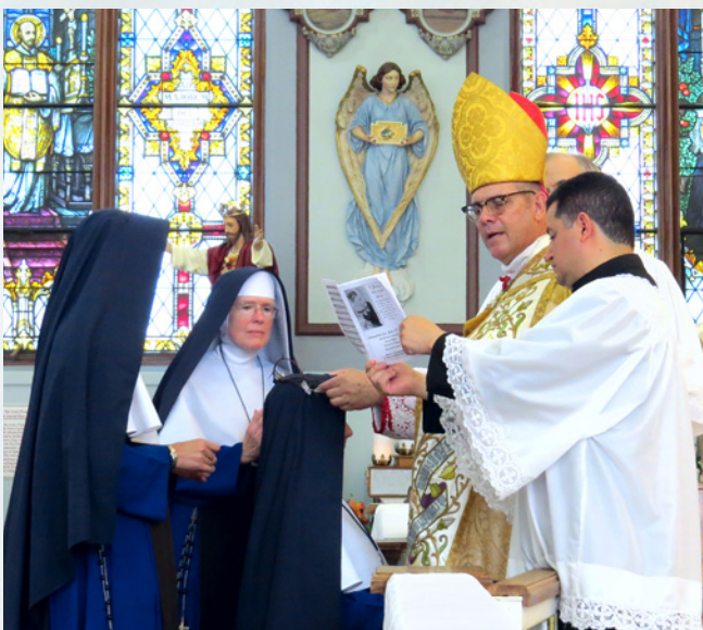
A crown of thorns is received at Final Profession, to remind us that we must be willing to share the sufferings of our thorn-crowned Spouse.