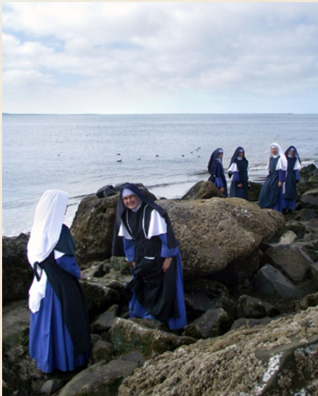
On the hunt for red starfish. The Novitiate Sisters enjoy searching Pacific tidepools on their outing.