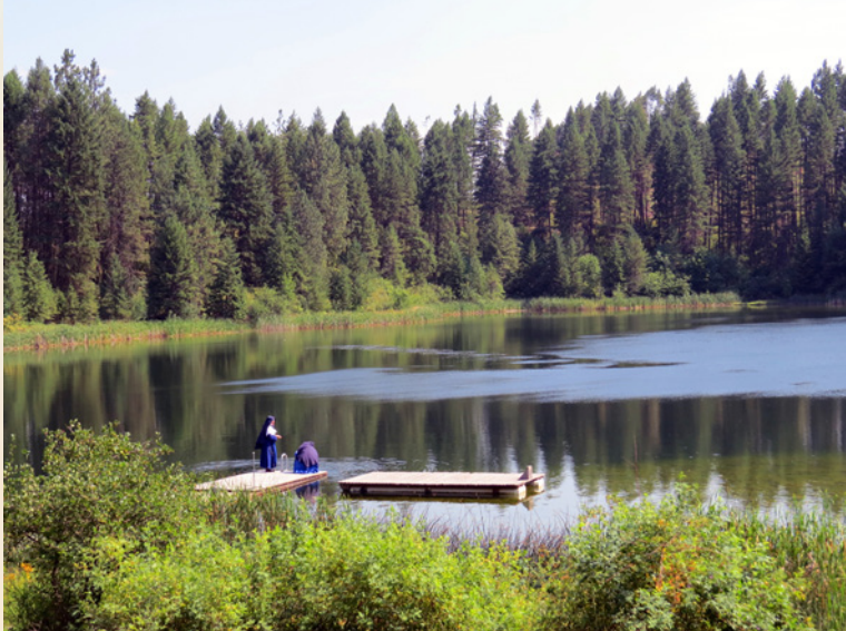
Getting away from it all... twice. After renewing their spirits on the annual retreat, the Sisters enjoy a week of rest and relaxation for mind and body on their outing.