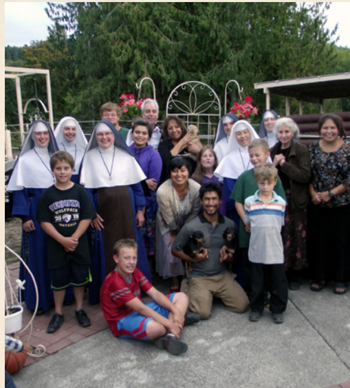
A part of the Novitiate outing includes visiting with and catechizing the extended Golbeck family in Sequim.