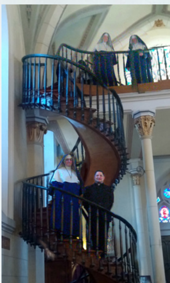
What a privilege to stand on the stairs that St. Joseph built!