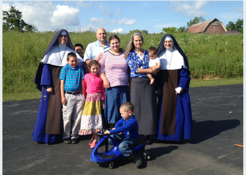
The Sisters say goodbye after a catechism mission in Utica, New York. Whether there are five souls or fifty, no class is too small when it comes to teaching the Faith.