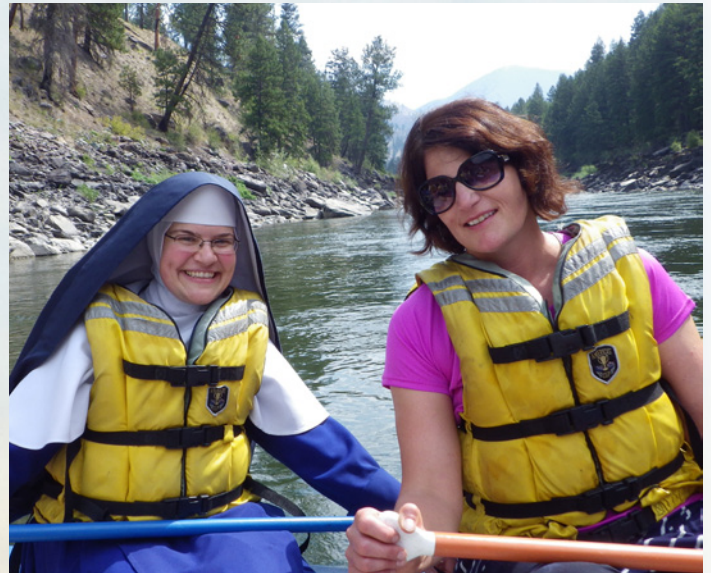
"Not so scary after all." Now that all is set right between God and the soul, whitewater rafting is a good activity choice after a ladies' retreat!