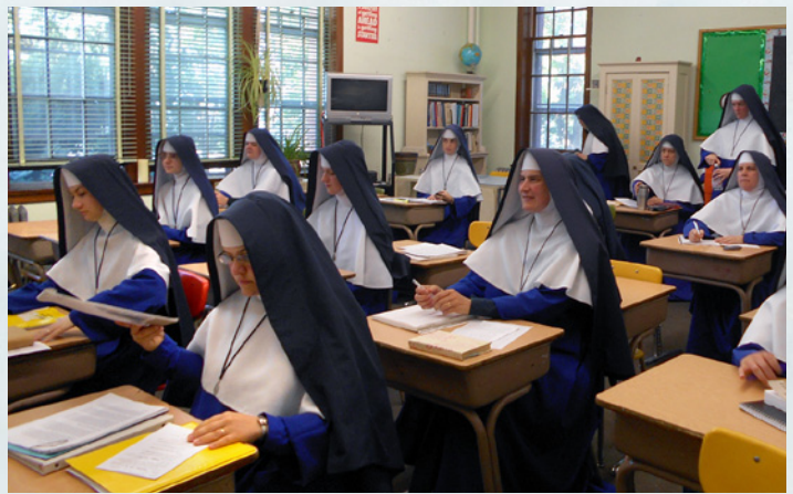
The teaching Sisters took the role of student as they attended classes by outside educators who came to share their expertise with them.

return to their assigned convents and duties. Those at the motherhouse had more than enough to do, especially at the Center, which doesn't really get a "vacation" in the sense that the school does. Mid-August found us all stationed in our various convents, busily putting to use not only the skills we learned during the summer, but also the renewed enthusiasm for this work for God and souls, which is so integral to our lives as religious Sisters.