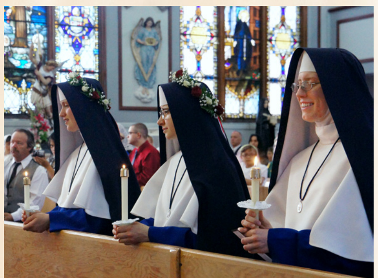
The lighted candles are symbolic of the wise virgins of the Gospel who kept their lamps trimmed in expectation for the Bridegroom, whom we are called to imitate.