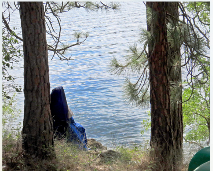
Retreat is a time to get away and spend some time in stillness with God, reflecting on the past year, and preparing our souls for the coming year.