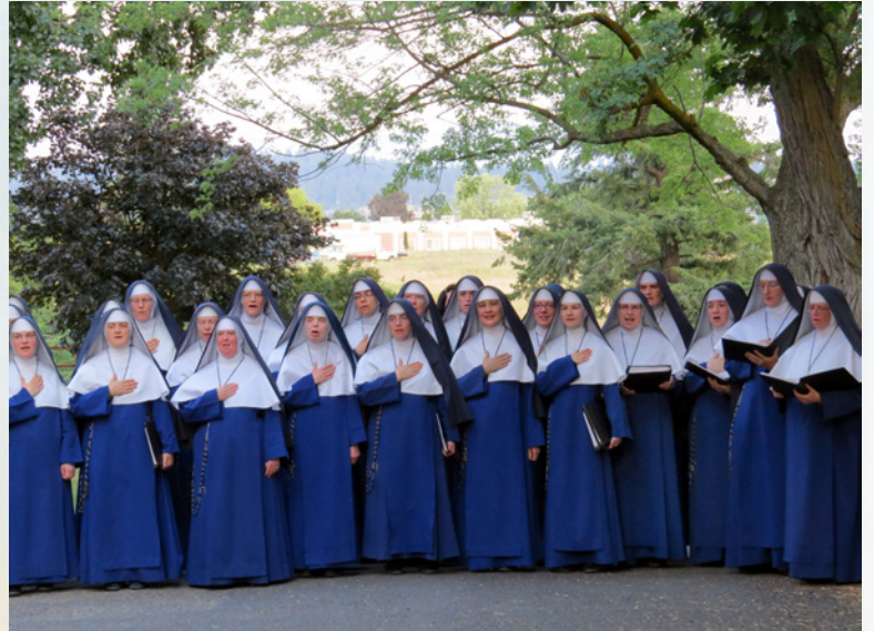
With hand over heart, the Sisters sing the National Anthem on July 4th, during the Presentation of Colors by the VFW Color Guard