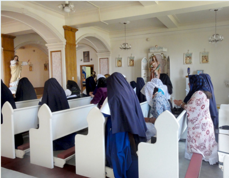
"Speak, Lord, for Thy servant heareth." During the annual Ladies' Retreat held at Mt. St. Michael, the participants had the opportunity to pray with the Sisters.