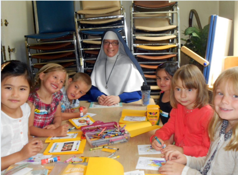
The children at Our Lady of Victory parish in London, Ontario, take a quick break from coloring their Ten Commandments booklets to pose for a picture with Sister.