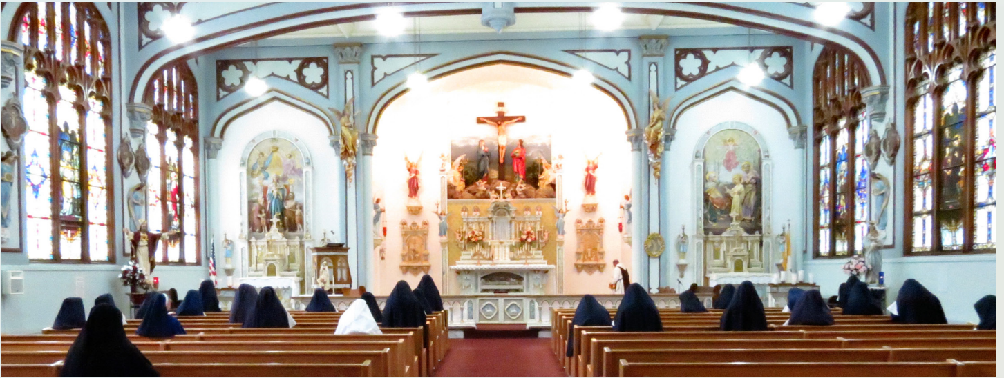
At the close of the annual retreat, three days of strict silence and recollection, the Sisters gather in the main chapel at Mount St. Michael to renew their Holy Vows.