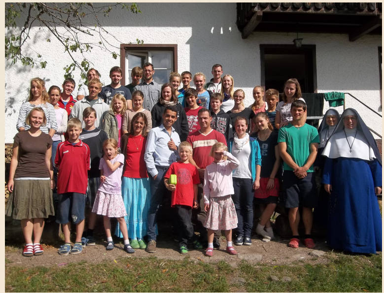
An international flavor! Youth from Germany, Austria and the Czech Republic, and Sisters from America, join together for a "Catholic" camp!