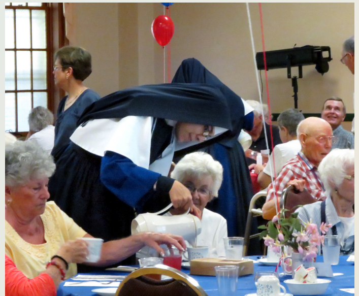
The Sisters acted as hostesses at the Singing Nuns' annual Luncheon Concert, sharing our joy with the Spokane community.