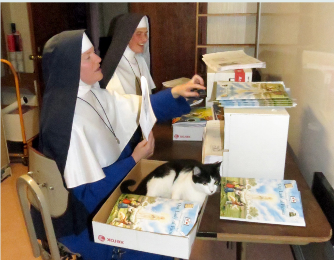
Mariah, the cat at Mary Immaculate Queen Center, finds her place in the work as Sisters help with a project.