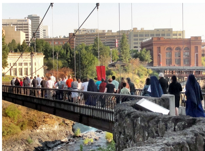
The Sisters join hundreds of other participants in the Rosary March in downtown Spokane on the 13th of every month from May through October.

The bulk of Our Lady's message seems to have been given during the July apparition. Here she taught them the familiar "Sacrifice Prayer": "O my Jesus, it is for love of Thee, in reparation for the offenses committed against the Immaculate Heart of Mary, and for the conversion of poor sinners." Our Lady also showed the children a vision of hell which remained indelibly impressed on their minds. The devotion to the Immaculate Heart of Mary was the means held out to save sinners from hell, to bring about the end of the war, the conversion of Russia and world peace, while a