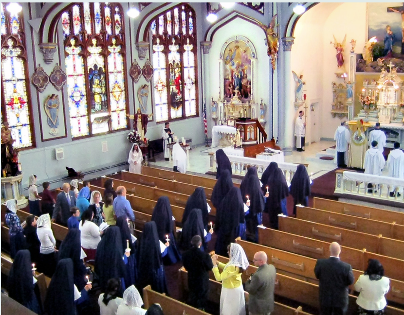
The ceremonies on the feast of Our Mother of Perpetual Help began with the Sisters processing into church with lighted candles while chanting the Salve Regina.