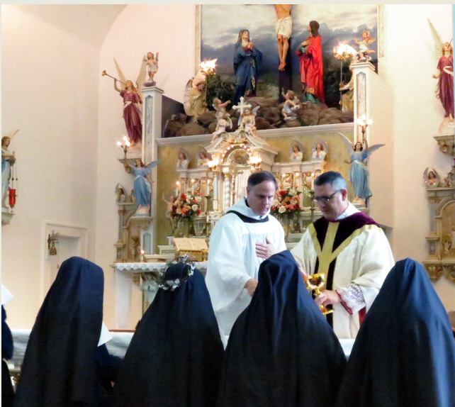
The reception of Holy Communion solidifies the union between the soul of each Sister and her Beloved, a union strengthened daily.