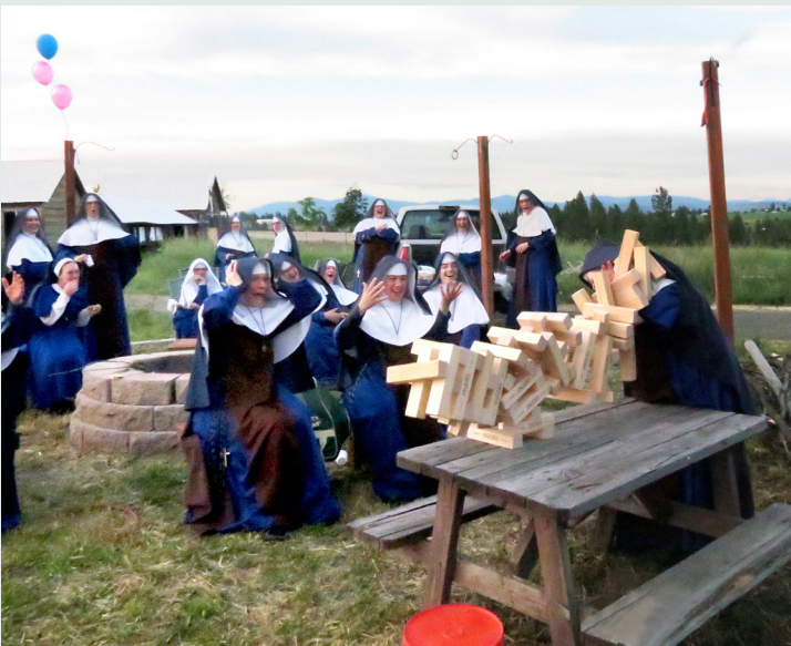
OH NO! The Sisters react as the tower of giant Jenga blocks tumbles down upon the poor Sister who added the last block.