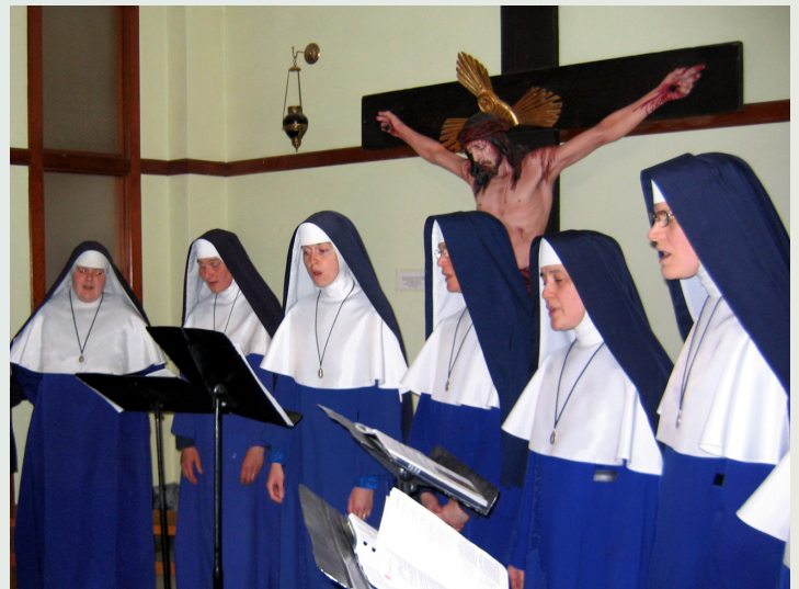
Lift ye up your voices... The Sisters recorded their latest album, a collection of Advent hymns, earlier this summer.