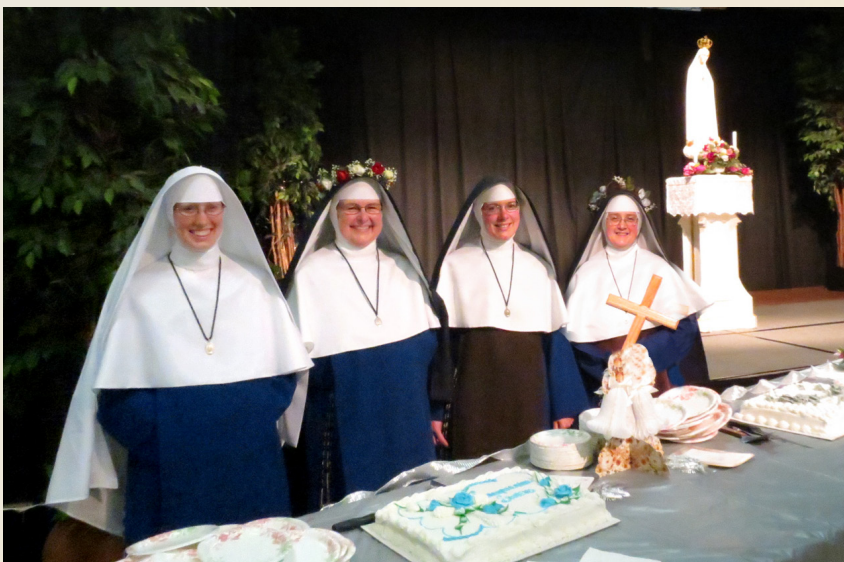
Beaming faces reveal the joy in the hearts of the Sisters who took steps on June 27th.