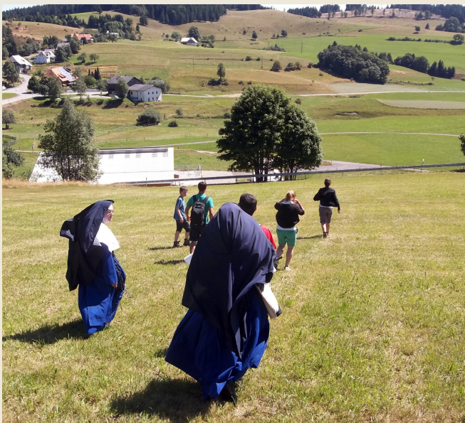
It wasn't ALL downhill! The Sisters join a group on a hike through wooded hills from Oberbach to St. Blasien in the southern Black Forest (Germany).