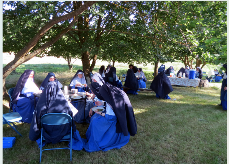
With all the Sisters home from mission, the community enjoys an afternoon of family time at the Novitiate.