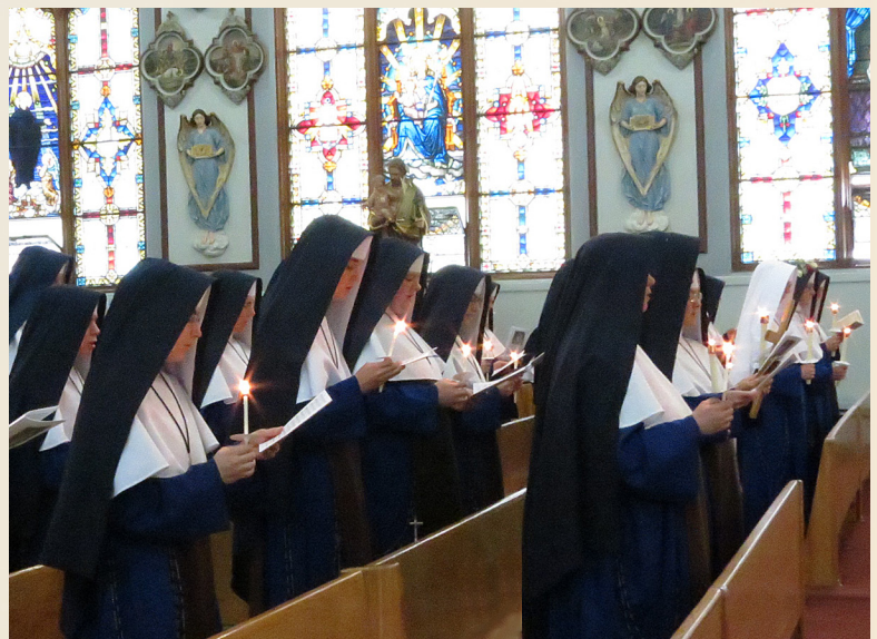
At the closing of the ceremonies, the Sisters chant the Te Deum, the Church's hymn of thanksgiving.