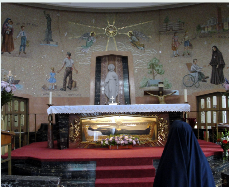
The Sisters on mission in New York had the privilege of visiting the shrine of Mother Cabrini in Manhattan.