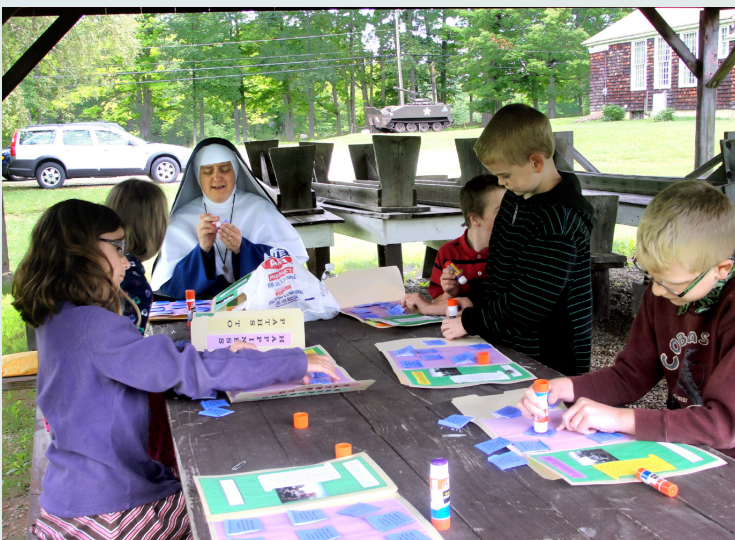
Teaching catechism in the Berkshires. A colorful hands-on project gave each child a wealth of information to take home.