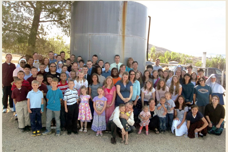
Hot weather didn't stop this tough crowd from gathering for a group photo. Four Sisters went down to California in July to teach catechism in the Santa Clarita area.