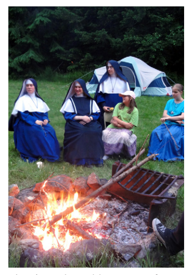
There's nothing like a campfire in the great outdoors!