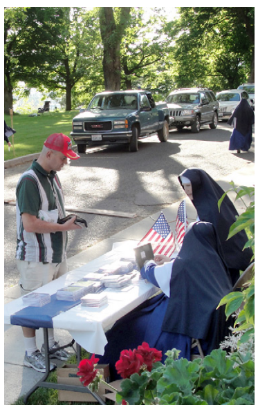
A guest buys a CD from the Sisters' table before the concert.