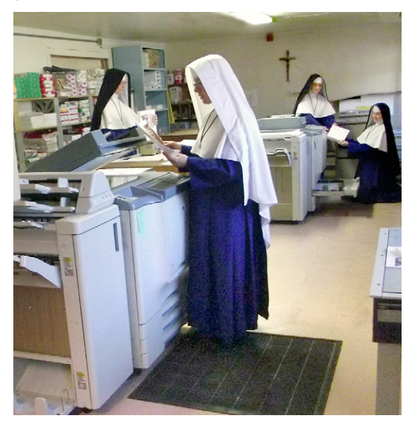
Several Sisters at work in the printing department of Mary Immaculate Queen Center.