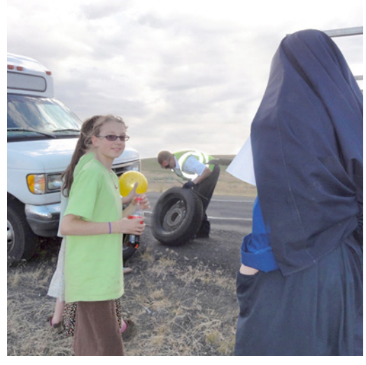
The girls' camp adventures included a blowout on the drive home. ("O my Jesus, it is for love of Thee...")