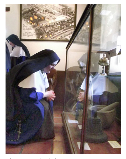
The Sisters had the opportunity to visit some of the California missions...