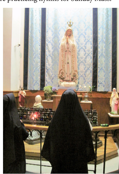
Our Boston Sisters kneel before Our Lady of Fatima at St. Anne's Shrine in Fall River, Rhode Island.