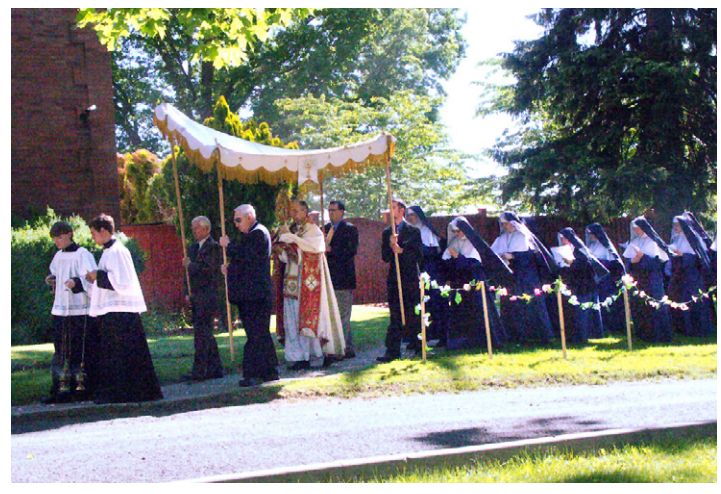
What a privilege to walk right behind the Blessed Sacrament in the Corpus Christi procession!

We have two main apostolates: Catholic education and the apostolate of the press, both of which serve as means of