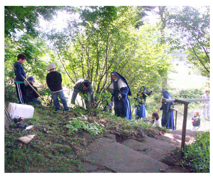
The Sisters and parishioners work together to prepare the Mount grounds for the 4th of July Sing-along.