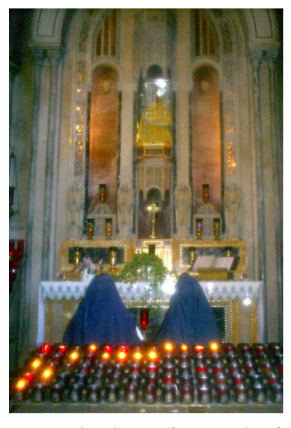
Visiting the shrine of Our Lady of Consolation in Carey, Ohio.