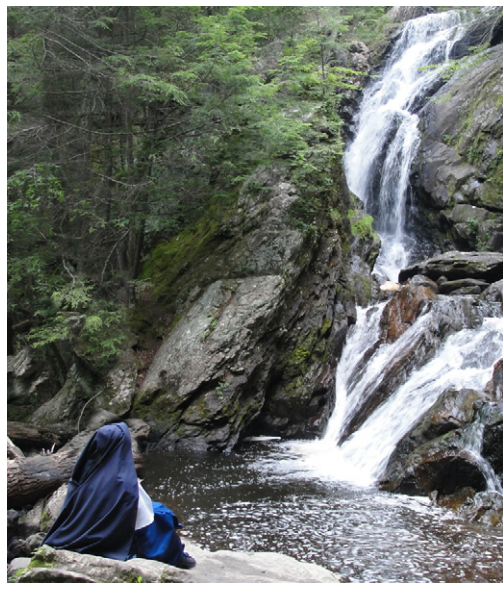
Sister pauses for a quiet moment at a waterfall near the home of a Catholic family in the Berkshires.