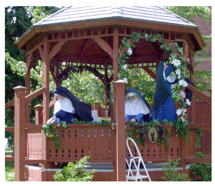
Three Sisters decorate the gazebo for the Corpus Christi procession.