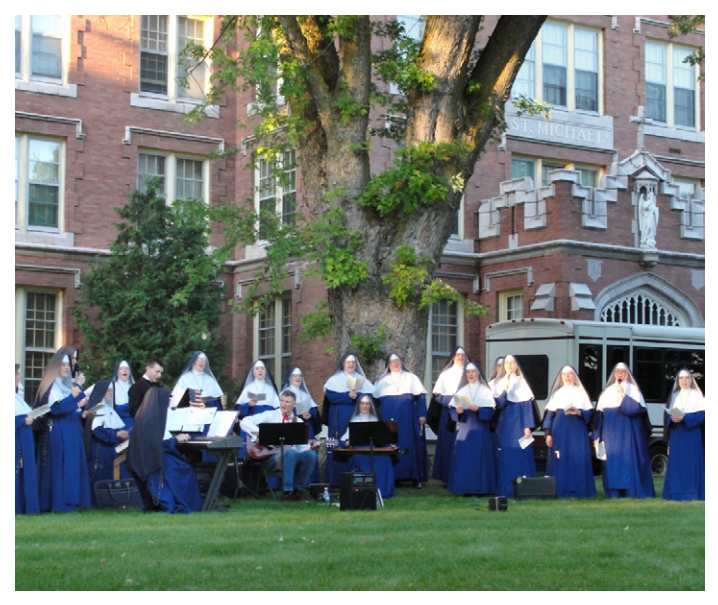
On July 4, the Sisters held an informal sing-along concert on the front lawn of the Mount.