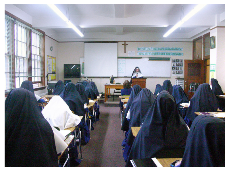
The Sisters take advantage of the summer break to attend classes to help them in their apostolates and to strengthen their family spirit.