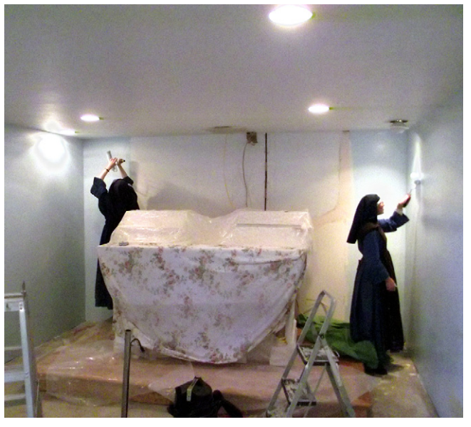
The Sisters at the novitiate have been busy working on a new chapel.