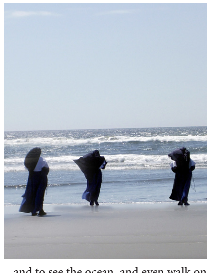
...and to see the ocean, and even walk on the beach.