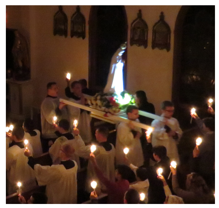
Seminarians carry the statue of Our Lady of Fatima in a Rosary Procession on October 13th

The bottom line and the most important issue that faces the world today is the eternal loss of souls. And this is the reason why the work of the seminary is so essential—to prepare young men to carry on the mission of the Church to save souls and to be other Christs: to offer the Sacrifice of the Mass, to administer the Sacraments for the sanctification of souls, and to preach the Word of God.