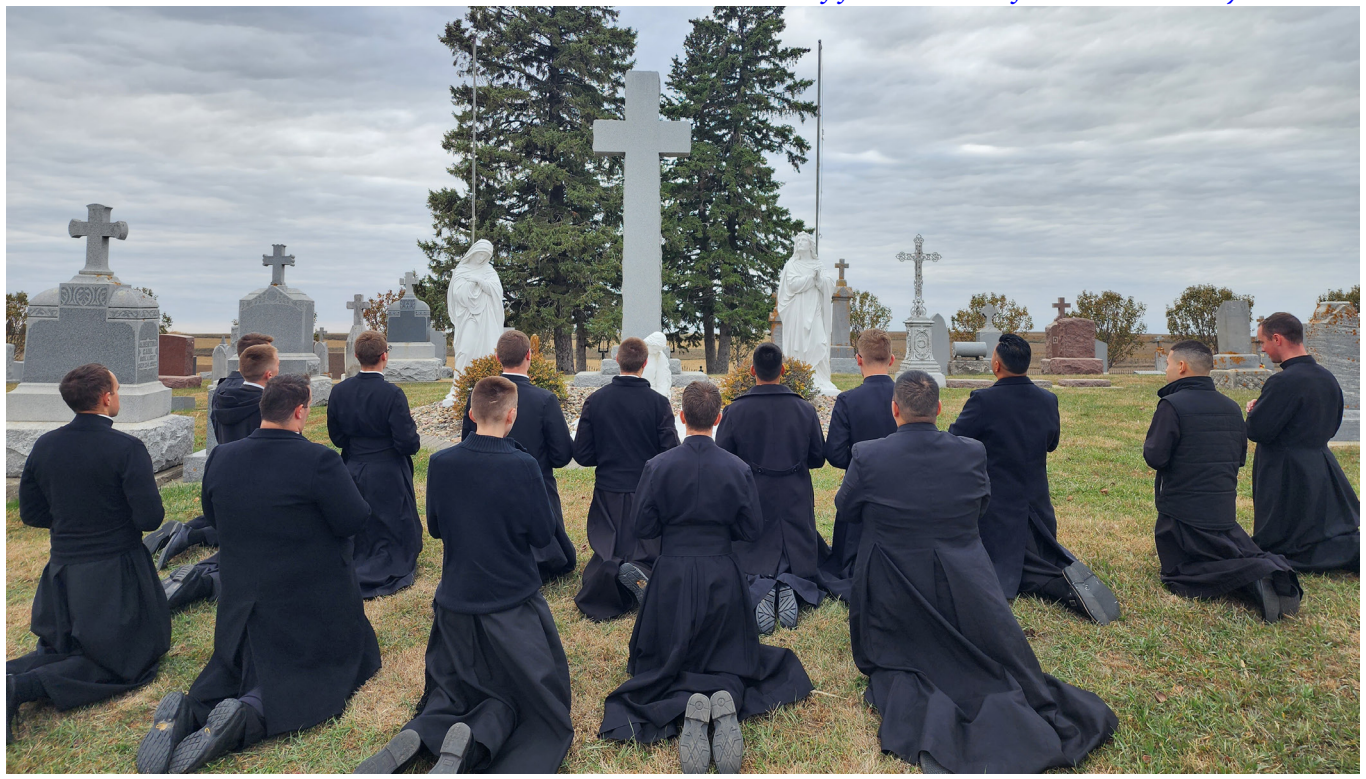
Seminarians pray for the Holy Souls in the Catholic cemetery in Earling, Iowa