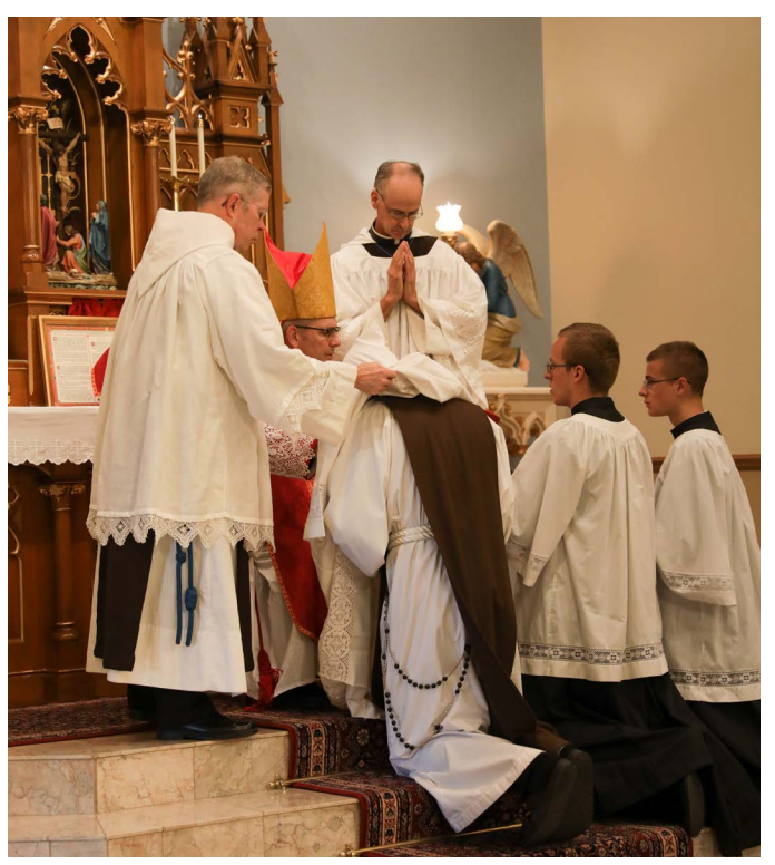
May the Lord put on thee the new man, who, according to God, is created in justice and in the holiness of truth

as the Catholic hierarchy insinuate that Christ has failed His Church. If Christ were with the Vatican II hierarchy, how could He have allowed them to publicly promote the heresies of false ecumenism, religious indifferentism, religious liberty, and modernism? These errors have been clearly condemned by previous popes: Pope Pius IX condemned religious indifferentism and religious liberty in his decree The Syllabus of Error; Pope Pius XI explicitly condemned false ecumenism in his encyclical Mortalium Animos; Pope St. Pius X condemned the errors of the modernists in his encyclical Pascendi . Pope Leo XIII, in his encyclical Satis Cognitum, taught that if the living magisterium could in any way be false, an evident contradiction follows; for then God Himself would be the author of error.