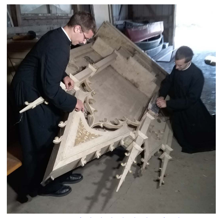
Seminarians refurbish the high altar for the new church in Huntsville, Alabama

Ordinis Pope Pius XII, 1947). No, the promise of Christ to be with His Church all days is not fulfilled with this modern Conciliar Church of Vatican II.