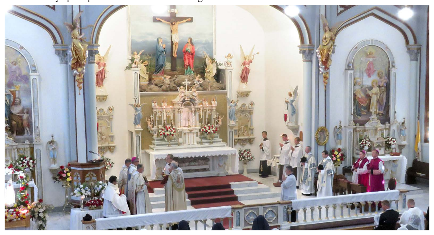
Solemn Pontifical Mass during the Fatima Conference at Mount St. Michael in Spokane, Washington