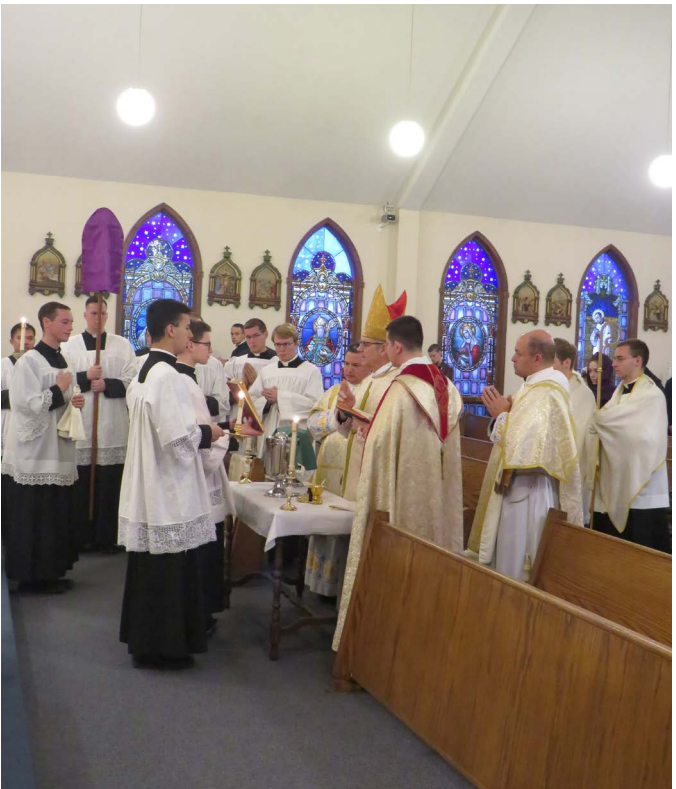
Blessing of Holy Oils during The Mass of Chrism on Holy Thursday