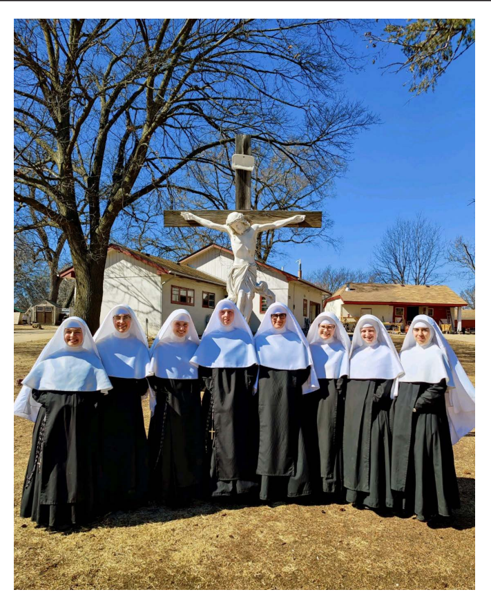
Novice Sisters of the Congregation of the Mother of God assist the church and seminary with manual labor during their spiritual formation