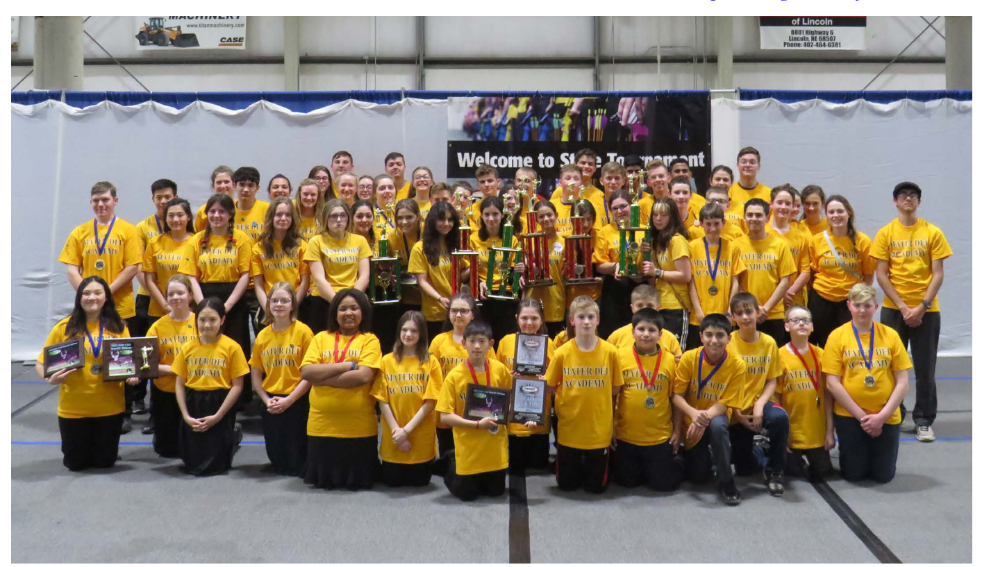
Mater Dei Academy Archery State Champions secured six trophies for the high school, middle school, and elementary levels in both bulls-eye and 3-D competitions