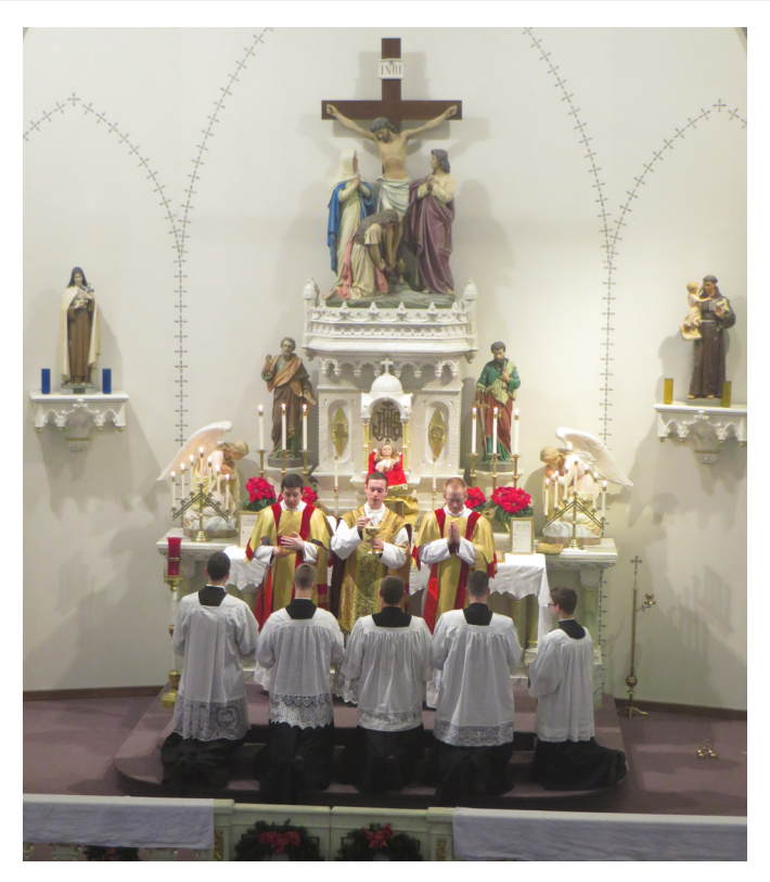
Solemn High Mass for the feast of the Purification