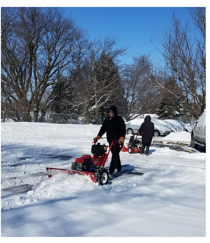
Seminarians maintain our parking lots and sidewalks