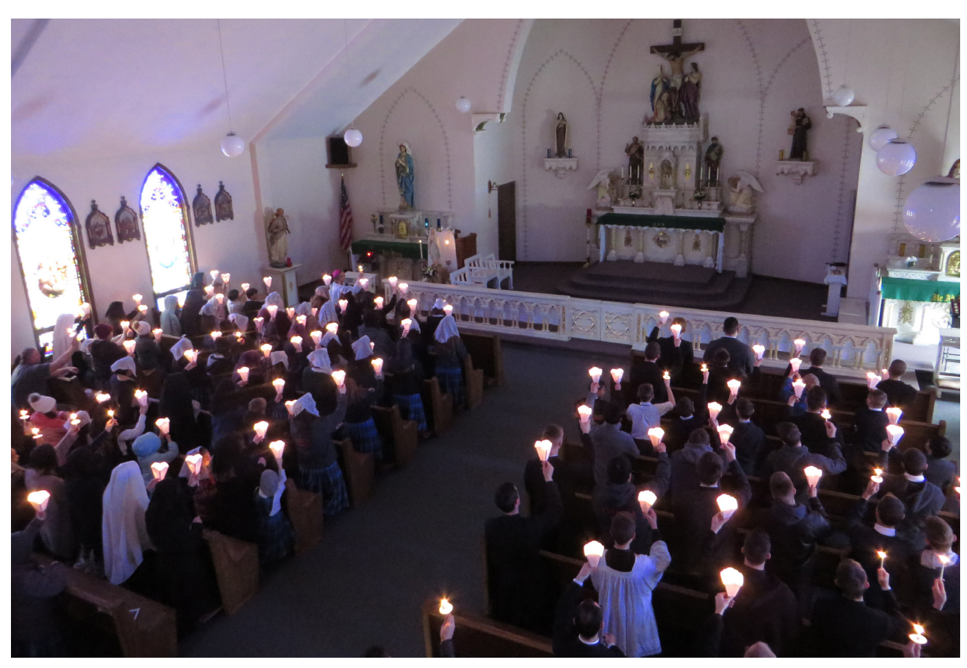
Candlelight Rosary in honor of Our Lady of Lourdes