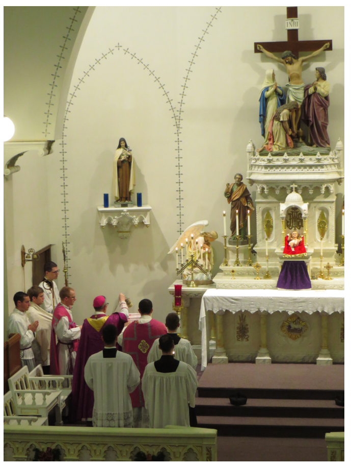
Blessing of Candles

One important aspect of the seminarians' education is that of the liturgy and Gregorian Chant. It behooves