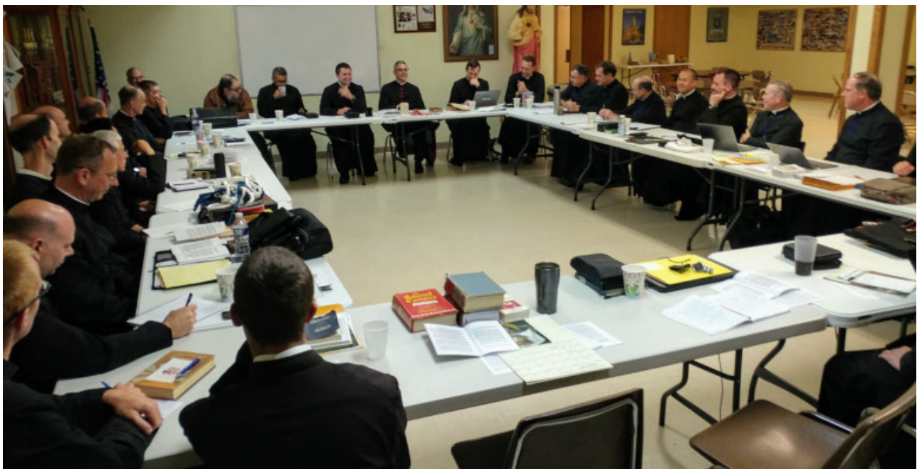
Our Bi-annual Priests' Meeting in July with 28 priests in attendance