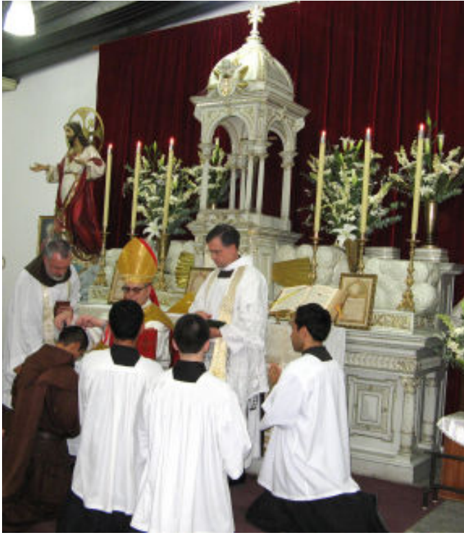
First Clerical Tonsure