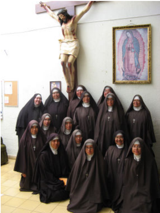
Sisters of Divine Providence