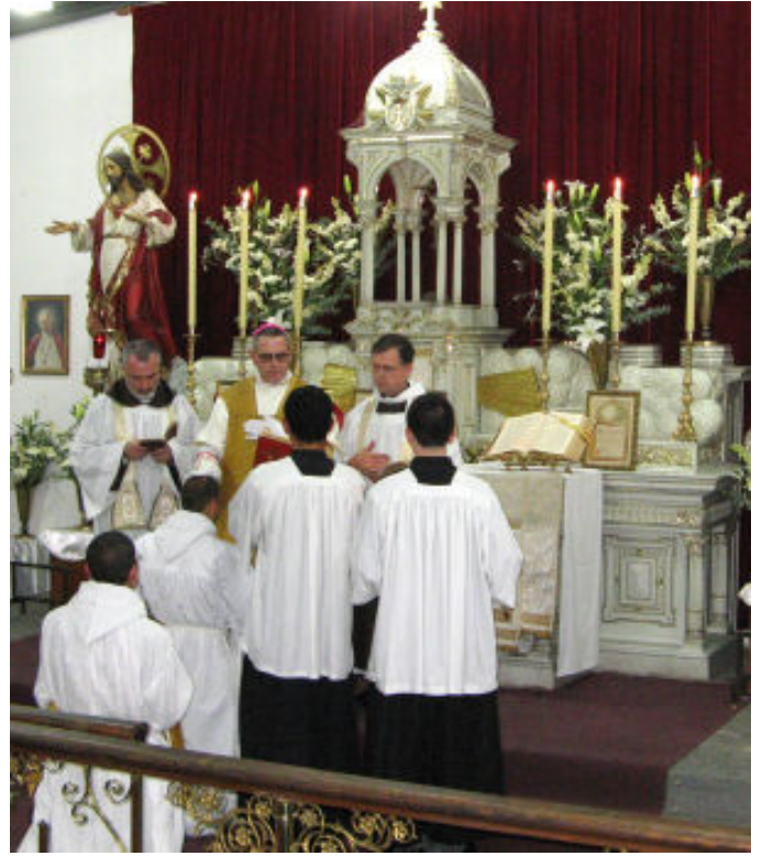
The Imposition of Hands for the Diaconate